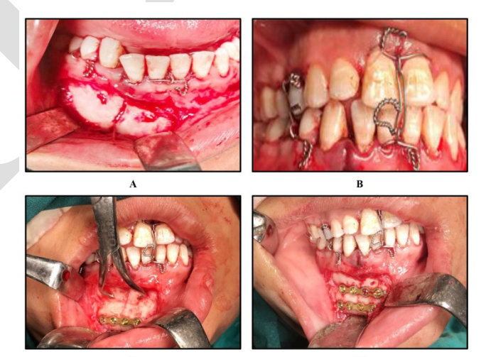
Figure (1): (A) Clinical photograph showing right displaced mandibular parasymphyseal fracture, (B) showing gaining IMF, (C) showing bone reduction forceps in place and application of single miniplate adapted and fixed to the reduced fracture and (D) showing final situation after application of the 2 miniplates and screws.

Edema measurements and maximum mouth opening was compared across time by One Way Repeated Measures ANOVA.