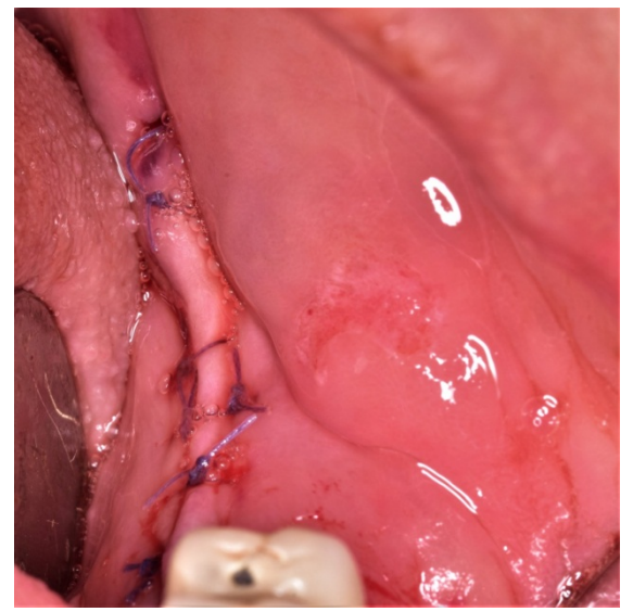
Figure (5): Primary wound closure