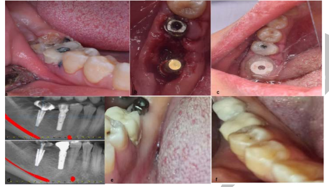
Figure (1): Showing a-clinical preoperative picture, bimplants after insertion, c- customized healing abutment, d-CBCT immediate postoperative and at 6 months e- final abutment in place and f- final prosthesis.

Data were documented, tabulated, and statistically analyzed utilizing the IBM SPSS package version 20.0 (Armonk, NY: IBM Corp). The info was given by exploitation vary (minimum and maximum), mean, variance, and median. The ANOVA with perennial measures check was used for unremarkably distributed quantitative variables, to check between over 2 periods or stages, and also the Friedman test for the abnormally distributed quantitative variables. The significance of the obtained results was judged at the 5% level (P<0.05).