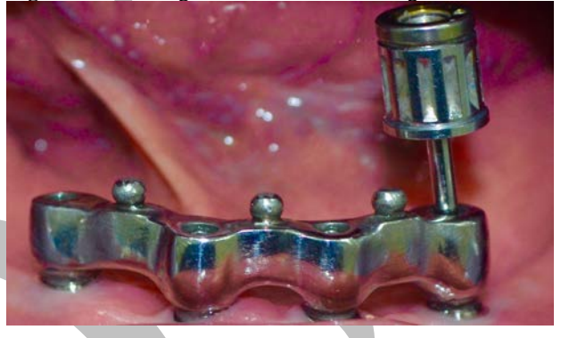
Figure 5: Showing XCP-DS fit universal sensor holder with an interocclusal index for standardization of Periapical x-rays.