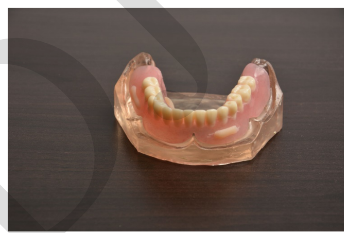
Figure 2 : showed mandibular overdenture after finishing and polishing.