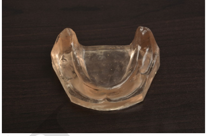
Figure 1: showed an edentulous mandibular heat cured acrylic resin model without ridge undercuts

attachment systems was done using ANOVA followed by Tuckey post hoc test with adjustment for many comparisons. Significance was set at P \leq 0.05 . Analysis of data was done using IBM SPSS statistical software (version 23).