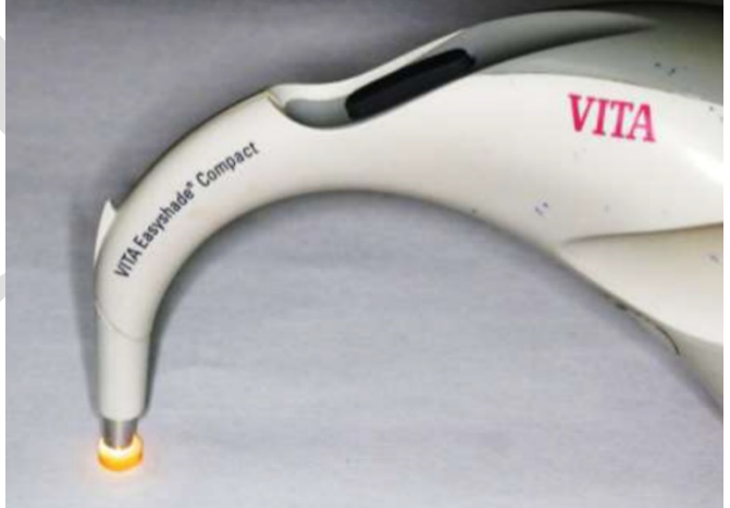
Figure 1: Holding the probe tip of the (VITA Easy Shade compact) at 90^{\circ} against white background over the composite specimen.

Data were fed to the computer and analyzed using IBM SPSS (Statistical Package for Social Science) software package version 20.0. (Armonk, NY: IBM Corp). The Kolmogorov-Smirnov test was used to verify the normality of distribution. Mann Whitney U test was used to assess the differences of \Delta E between the study groups. Significance of the obtained results was judged at the 5% level. Quantitative data were described using range (minimum and maximum), mean, standard deviation and median.