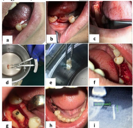
Figure 1: Showing the surgical steps Site of grafting b) flap release c) harvesting the graft d) the autogenous bone e) drilling for screw f) decortection g) securing the graft by screw h) suturing the flap i) immediate post-operative position of the screw