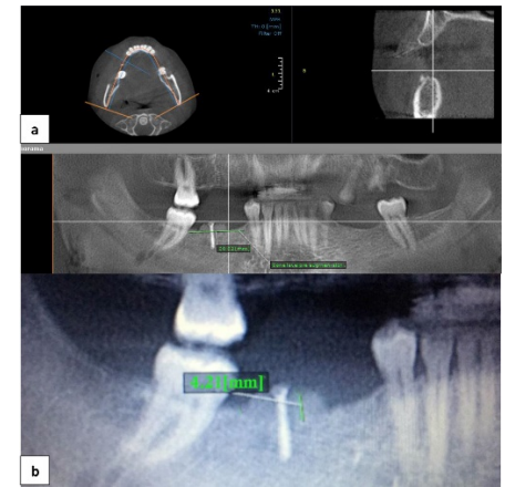
Figure 3: Showing a) CBCT immediate post-operative and b) 6 months post-operative