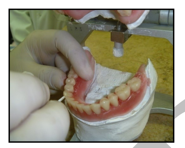
Figure (1): Addition of a light-cured composite resin in the lower canines

Denture insertion was done with verifying each occlusion concept to be the same as it was created on the same articulator (Whip MIX Articulator model 8500,U.S).The change from BBO to CGO of all dentures was performed clinically by the same dentist through the addition of a lightcured composite resin in the lower canines (figures 1).