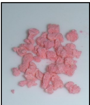
Figure (3): Tested colored beads

The powdered ingredients were mixed by a geometric addition technique in a mortar for 5 min. The aqueous dispersion of pectin was added gradually until a smooth paste was obtained. The paste was granulated in Erweka Wet Granulator (Germany) to produce wet granules. The granules were spread in trays and dried in an oven for 8 hours. Then the granules were coated by spraying acetone solution of Eudragit (E100) on the beads with gentle mixing with a spatula. The coated beads were left to evaporate the solvent at room temperature for 6 hours. Then, 250 mg of the coated beads were packed in 13mm long gelatin capsules with 0.9 mm thick walls, inner diameter of 7.00 mm and outer diameter of 8.00 mm. The capsules were sealed by welding to prevent the entrance of their content into the oral cavity (Fig.3).