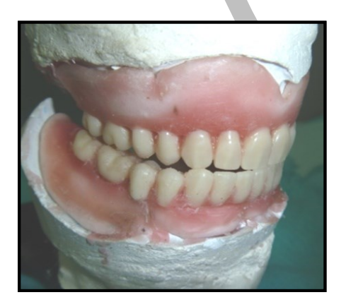
Figure (2): An interarch disocclusion space of 2 mm in the molar region durin eccentric movements.

Objective evaluation of masticatory function was performed through a colorimetric technique (8). Prepared beads were used to be as the artificial test-food used to measure masticatory efficiency. The beads were prepared by ionotropic jellification of an aqueous dispersion of 2%w/w pectin containing 50% solids and a FDA approved red dye of 0.2 % w/w concentration (Table 1).