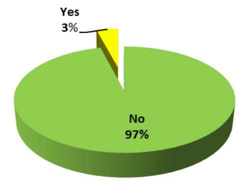
Figure (1): Distribution of the studied mothers according to attending courses before about iron deficiency anemia.