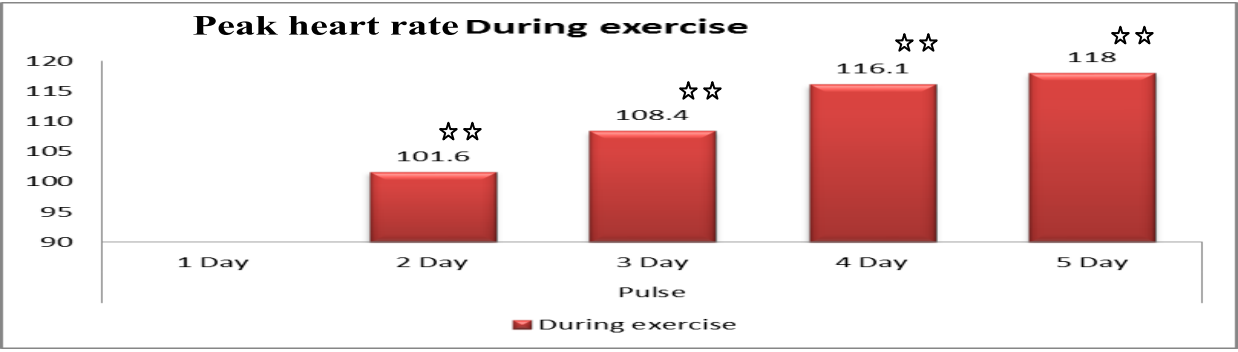
Figure (1) : Peak heart rate during exercise in study group.

** There is a significant difference at p<0.01