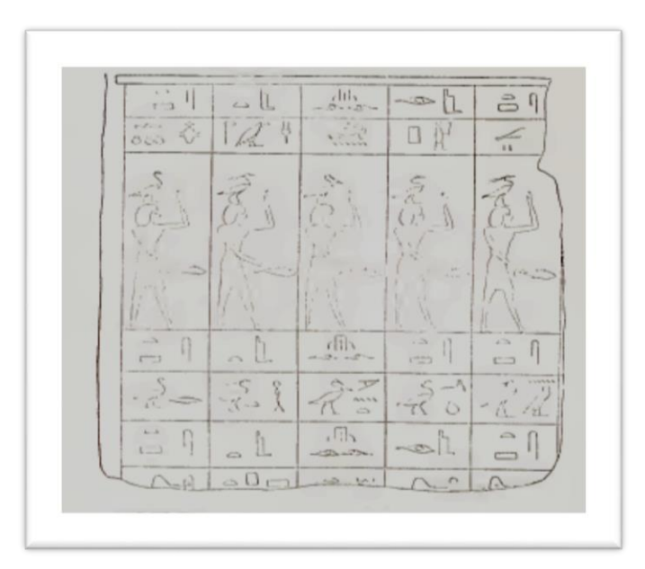
Fig 3 Offering bearers carrying the sacred bird of goddess Henut(white pelican) among other birds, hall of festival of Osorkon II

She was represented as a complete white pelican as in the scene of the hall of the festival where the Henut pelican appeared among other birds offered by offering bearers of King Oserkon II to the different deities and the name of the bird was written on the columns underneath the scene Hnt \int_{-\infty}^{\infty} fig. 1<sup>20</sup>