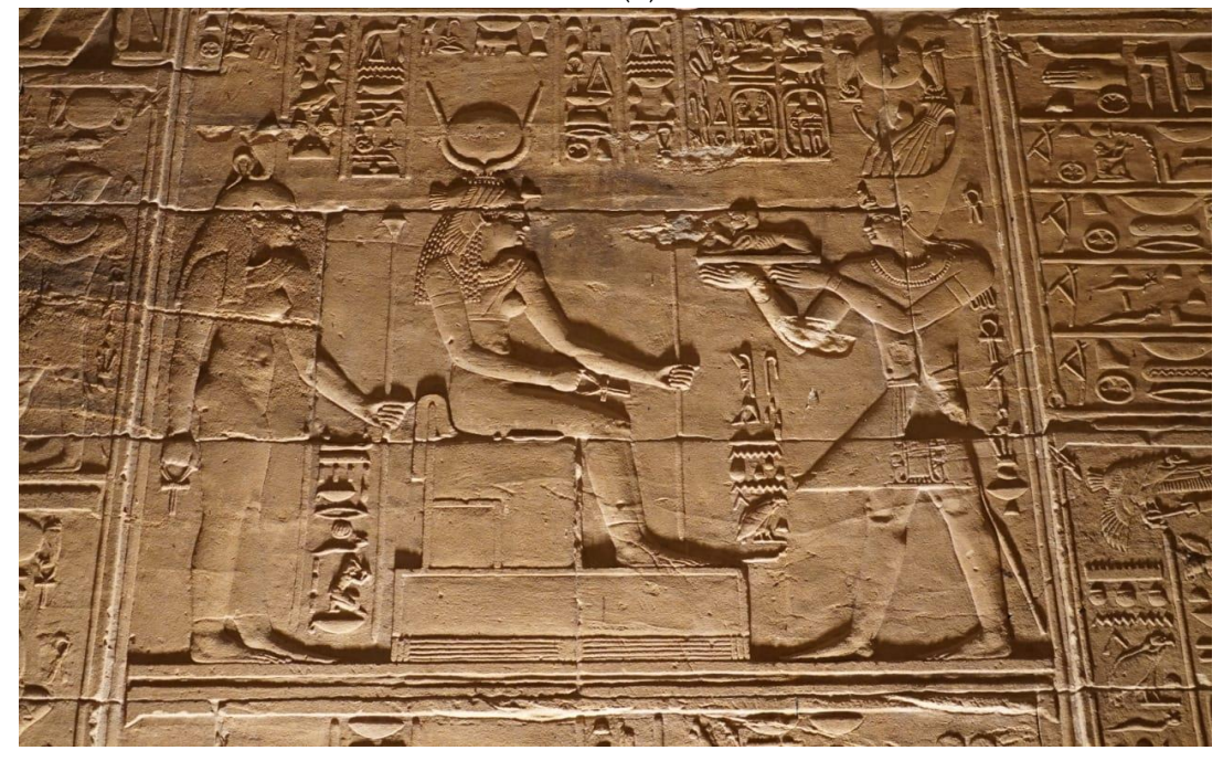
Fig (5) PLATES

Making Offerings Scenes of the king Ptolemy II "Philadelphus" Philae Temple The Inner Vestibule before the Sanctuary of the Temple