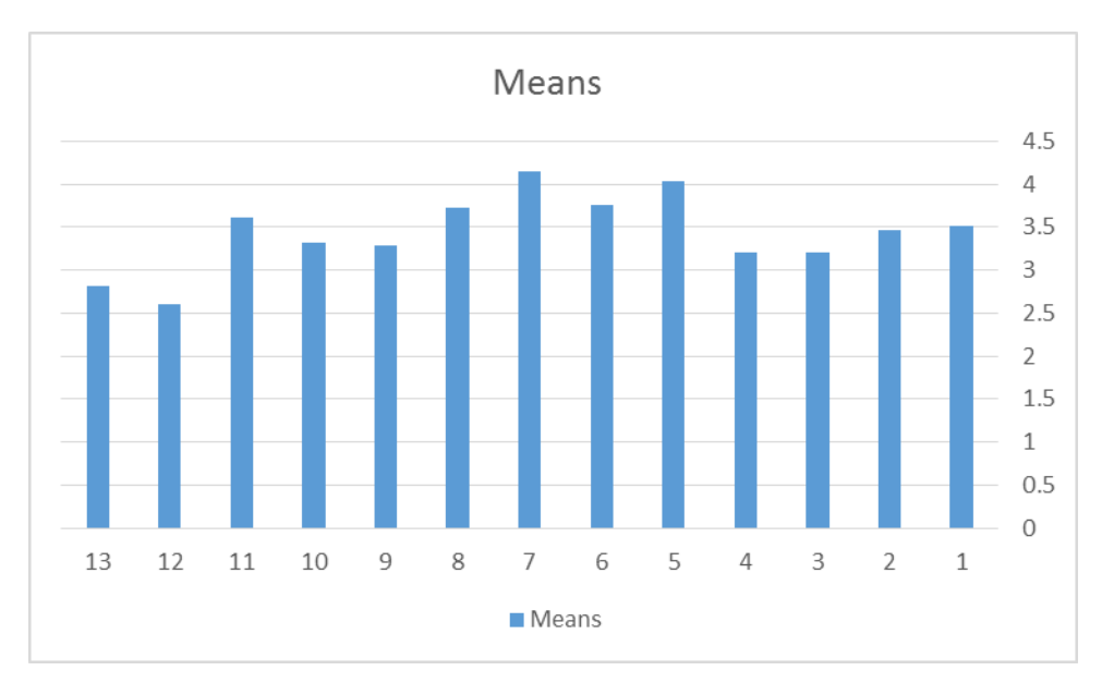
Figure 1 Average values of use