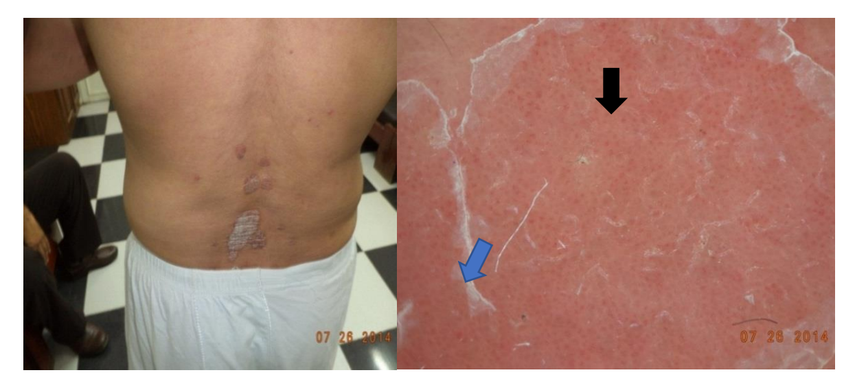
Figure 1 . Male Patient 52y with psoriasis vulgaris. Dermoscopic picture show bushy capillaries (black arrow) (numerous and uniformly distributed), erythema and scales (blue arrow).

Table 2. Effect of skin phototype on dermoscopic finding in psoriasis: