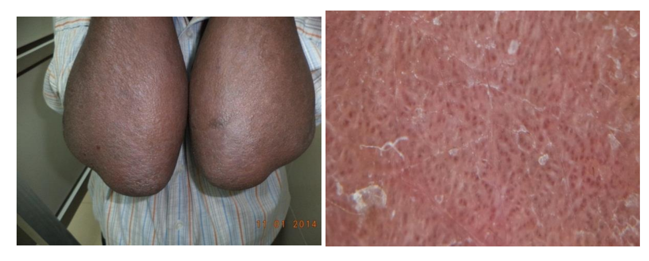
Figure 3. Male Patient 48 years old with skin phototype 5. Dermoscopic examination showing clear bushy capillaries , erythema and scales with no effect of skin color.

Figure 2 Male Patient 56 years old with skin phototype 1. Dermoscopic examination showing clear bushy capillaries (black arrow), erythema and scales (blue arrow).