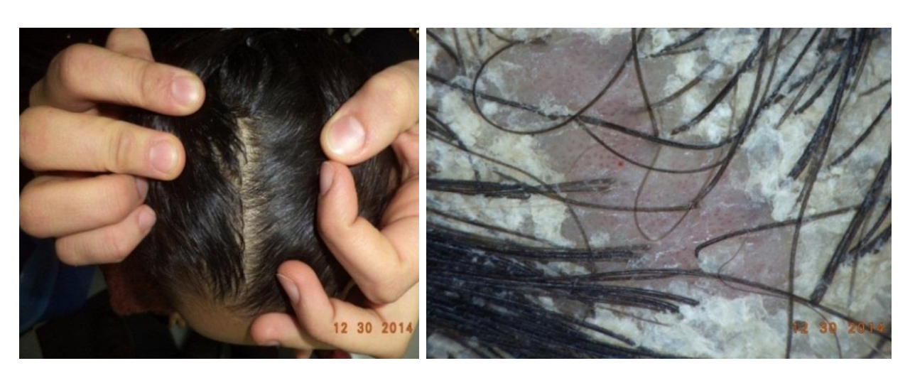
Figure 6 . Female patient 7years old with scalp psoriasis. Dermoscopic examination shows bushy capillaries, erythema and scales.