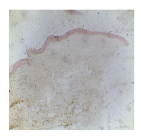
Figure (4): A 55 years old male with vitiliginous lesion biopsy taken from affected skin and stained with Sudan III shows negativity of cholesterol in dermis

research references, that many lipid-lowering agents were found to increase melanogenesis ( Pillaiyar et al. , 2017).