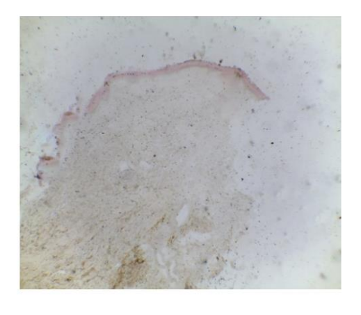
Figure (3): A 50 years old female with vitiliginous lesion biopsy taken from affected skin and stained with Sudan III shows negativity of cholesterol in dermis