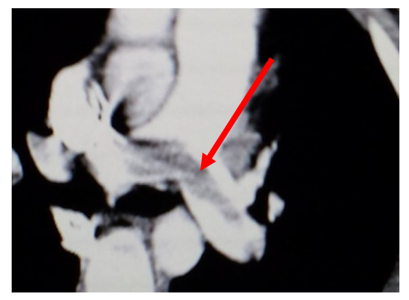
Figure (3): Saddle shape pulmonary embolism (arrow) in post partum female patient 28 years old presenting by chest pain and shortness of breath.

In this study, the main clinical presentations were dyspnea (96.6%), palpitation (88.3%), chest pain (71.6%), hypoxemia (65%) and cardiac arrest (3.3%). The most common ECG finding was sinus tachycardia (73.3%), S1Q3T3 pattern (15%), incomplete right bundle branch block (5%), complete right bundle