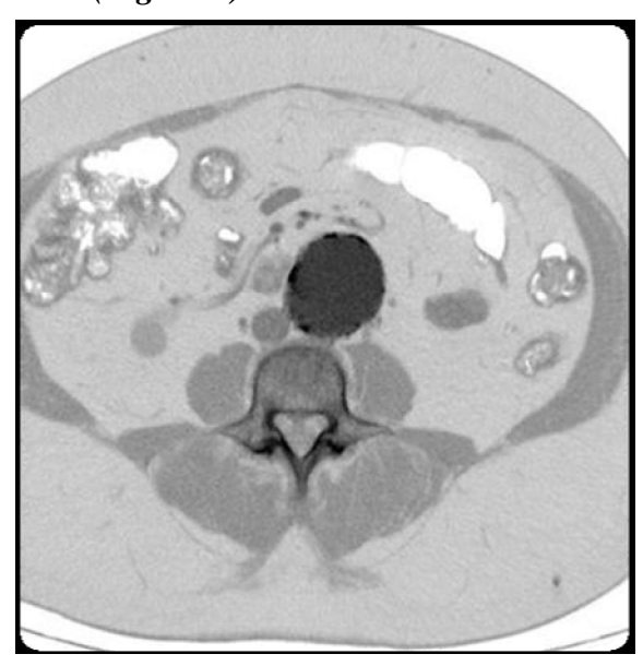
Figure (2): CT demonstrates abdominal aortic aneurysm (AAA). Aneurysm was noted during workup for back pain, and CT was ordered after AAA was identified on radiography. No evidence of rupture is seen (Isselbacher, 2005).

CT scanning evaluates the abdomen in more detail in patients with a specific abdominal complaint. It also assesses the shape of the aneurysm with more comprehensive anatomical details of the mesenteric and iliac arteries, and also provides better imaging of suprarenal aneurysms. Although USG is generally preferred, multislice CT angiography can be used for serial monitoring of aneurysm size ( Figure 2 ).