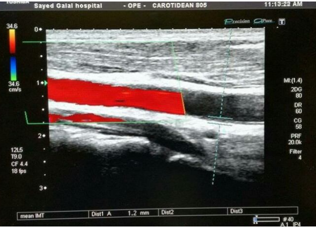
Figure (2): Measurement of IMT using Doppler US in a hemodialysis patient. IMT thickness = 1.2 mm. The increased IMT was directly linked to high levels of serum ADMA which was responsible for increased morbidity and mortality in these patients.