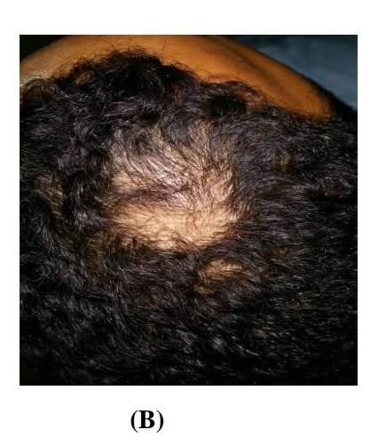
Figure (3): AA patch in the scalp: A. before and B. after PRP injection showing partial hair regrowth at the end of the study.

Administration of autologous PRP has led to an observable hair regrowth in AA lesions. There was hair regrowth evaluated by clinical and digital photography at the end of the study. Responding patients 18 (60%) showed regrowth at the end of the study. As