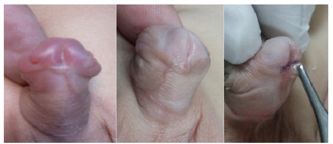
Figure (1): Different cases of distal hypospadias with mobile urethral meatus

Exclusion criteria: Cases with proximal penile, mid penile and subcoronal variety of hypospadias, hypospadias with chordee, congenital hypoplastic urethra and deep glanular groove.