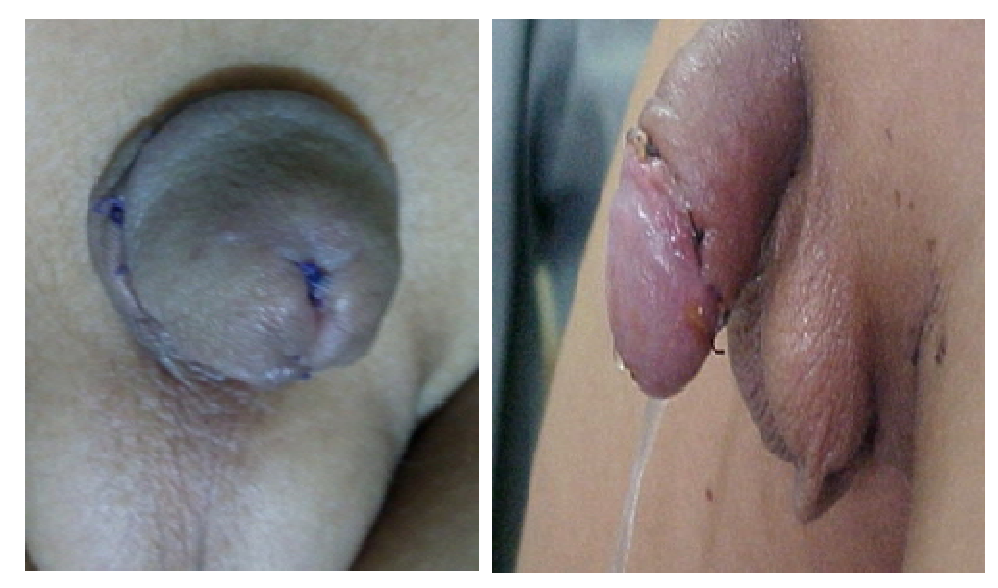
Fig (5): Early posto-perative direct and excellent urinary stream with straight penis & good slit-like urethral meatus

The mean follow-up period was 6 months. At the follow-up visits, a good slit-like urethral opening in a near normal looking glans was seen in 44 patients (97.78%) (Fig.5). One patient (2.22%) had mild meatal stenosis that corrected by frequent dilatation. Complication occurred