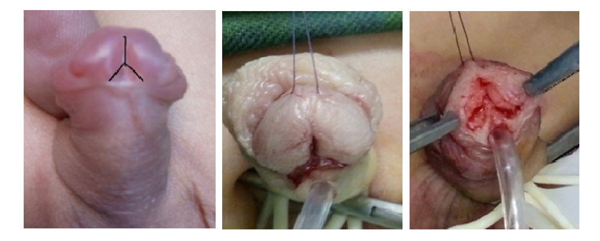
Figure (2): Mercedes benz incision was outlined on the glans and deepened with good mobilization o fglanular flaps.

Mercedes benz incision was outlined on the glans. The center of Mercedes benz was just above the ridge distal to the meatus. The longitudinal limb extended to the glanular tip where the neo-meatus was located. The incision was deepened, and the glanular flaps were mobilized to allow more mobility of the meatus (Fig. 2).