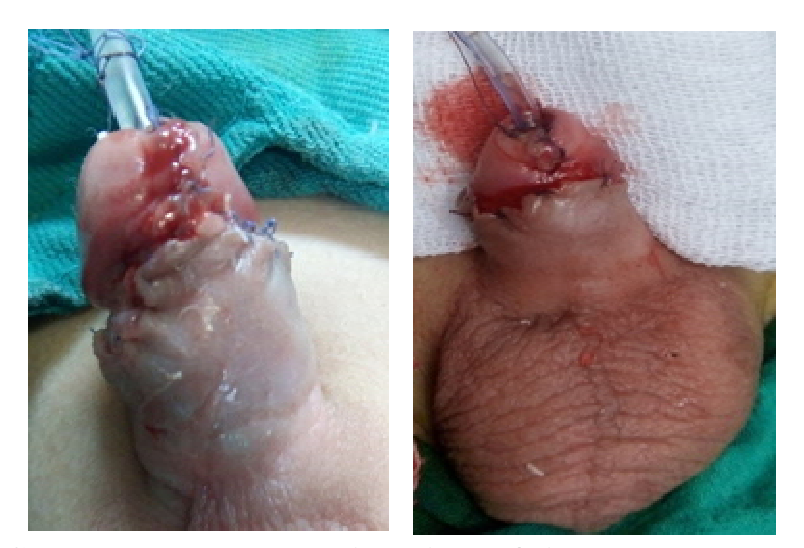
Figure (4): Glano-plasty was done using Vicryl 6/0 in a transverse mattress manner

The medial margins of the glanular wings were sutured with each other in the midline using Vicryl 6/0 in a transverse mattress manner (Fig. 4).