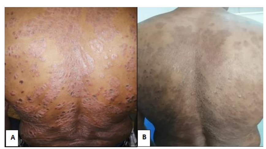
Fig.1. Male patient, 35 y old of 2 years duration showed marked improvement after 36 sessions.