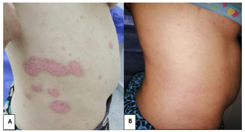
Fig.2. Female patient, 30 y old of 6 months duration showed a marked improvement after 24 sessions.