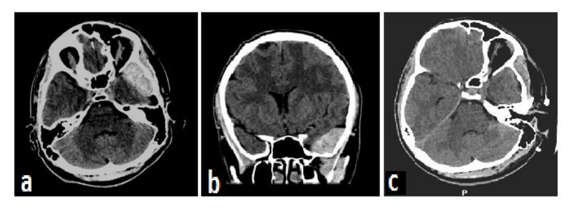
Figure 2: Preoperative (a-b) and post operative (c) Head CT images of a 11 years old boy with left temporal EDH

The discrepancy of our results could be explained by smaller sample size of the present study, but it also reflects the challenging conditions in developing countries where children are more vulnerable to traffic accidents due to increasing road traffic and lack of traffic regulations or safety measures in roads<sup>(1,3)</sup>. In our study, 64.7% of patients had mild head injury with a GCS score of 13-15 while 20.5% had moderate injury with a GCS score of 9-12, and 14.7% were comatosed and had a severe