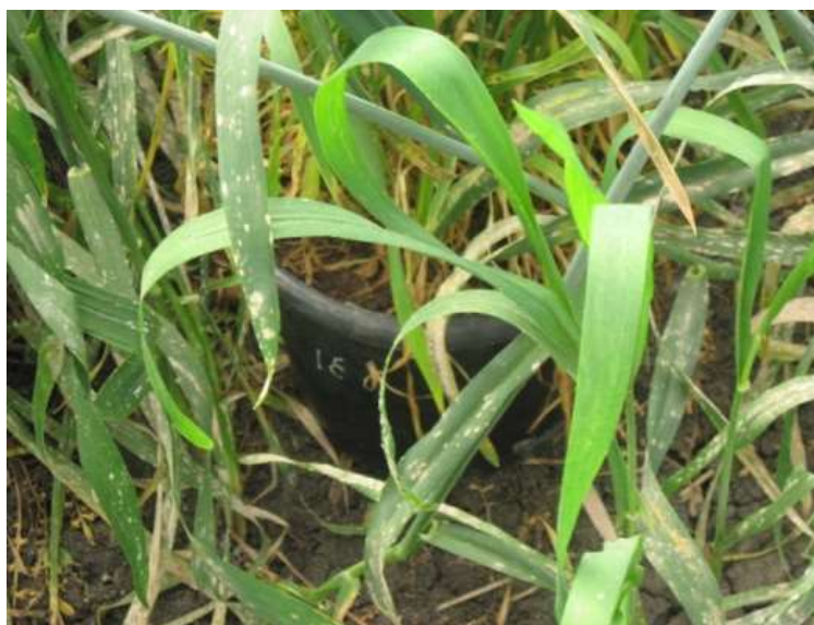
Fig. 2: Illustrate infected plants grown in pots used for inoculation inside the plot plants of the tested cultivar.