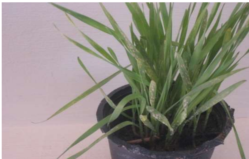
Fig.1: Conidia of powdery mildew multiplied on durum wheat plants under greenhouse conditions.