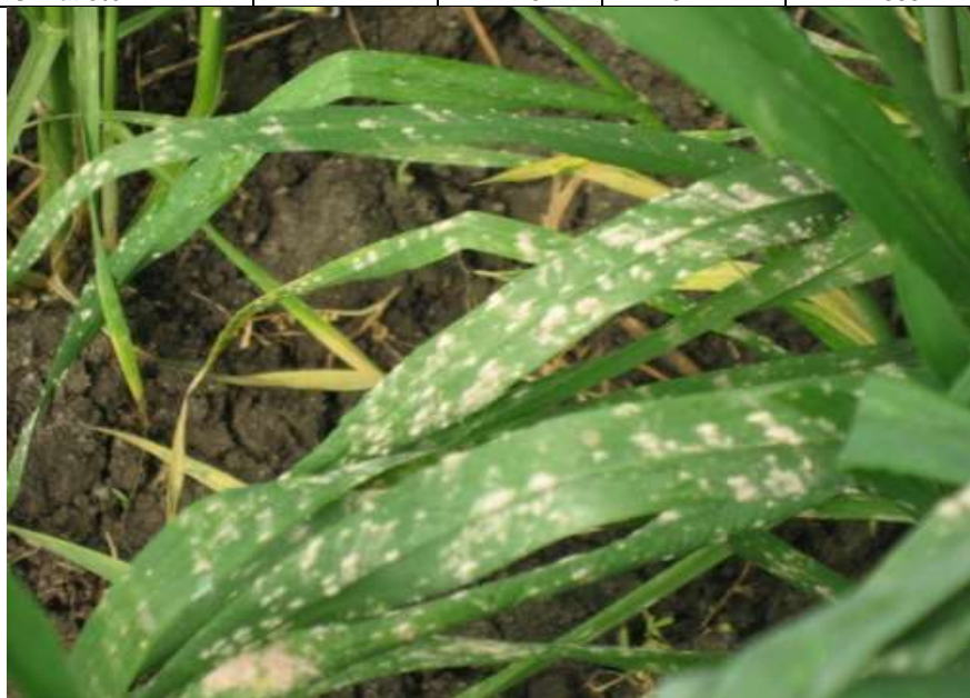
Fig.3 : illustrate severe infection of powdery mildew on experimental plants in 2010 growing season.