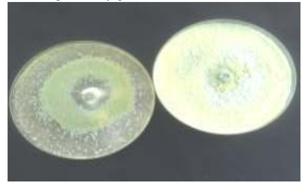
Fig. 1. Effect of thiamine in improving T. harzianum (T1) growth, the plate in left without thiamine and the right plate treated with thiamine

The positive effect of antioxidants and micronutrients was an expected result as most of them improved the metabolic activity and can be used by the fungus as a nutrients or coenzyme. Ivashechkin et al. (2015) mentioned that addition of an antioxidant increased the biomass yield of Lentinus tigrinus , as well as Cunninghamella japonica .