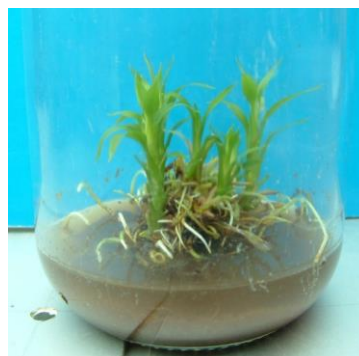
1/2 MS + 60 g/L banana pulp