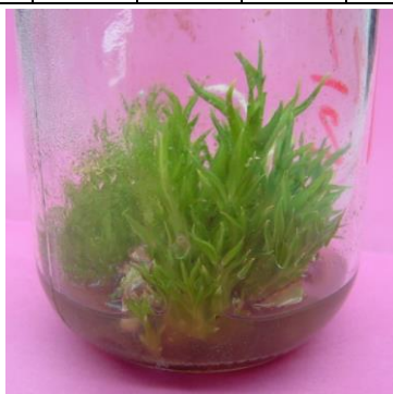
1/4 MS + 60 g/l banana pulp