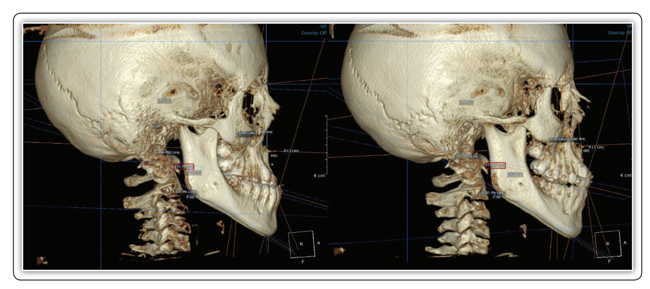
FIG (3) Sample of the linear and angular measurements using CBCT images

using automatic registration, where certain area was identified as area with minimum anatomical changes at both scans, and then the software matches both volume accordingly. Due to unavoidable discrepancy in positioning patients at the CBCT machine, another reorientation is made to ensure that both datasets are now aligned to reference planes (Frankfurt horizontal and midsagittal planes).