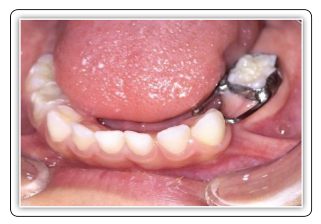
FIG (1) Band and loop space maintainer.

Impressions for group A of the upper and lower arches were made by alginate material, then sent to the lab for fabrication of band and loop space maintainer, Figure (1). Impressions for group B of the upper and lower arches were made by elastomeric impression material, then sent to the lab for fabrication of zirconia space maintainer, Figure (2). A fresh unstimulated whole saliva sample was collected from each patient by asking each child to spit in a sterile container (1st thing after getting up or at least 2 hours after a meal). The samples were collected before the insertion of the space maintainer, after 2 weeks and three months after its insertion. For determining S. mutans salivary levels, mitis salivarius with bacitracin agar was used according to the manufacturer's instructions. The same procedure was used to determine L. acidophilus salivary levels but using selective MRS Agar.