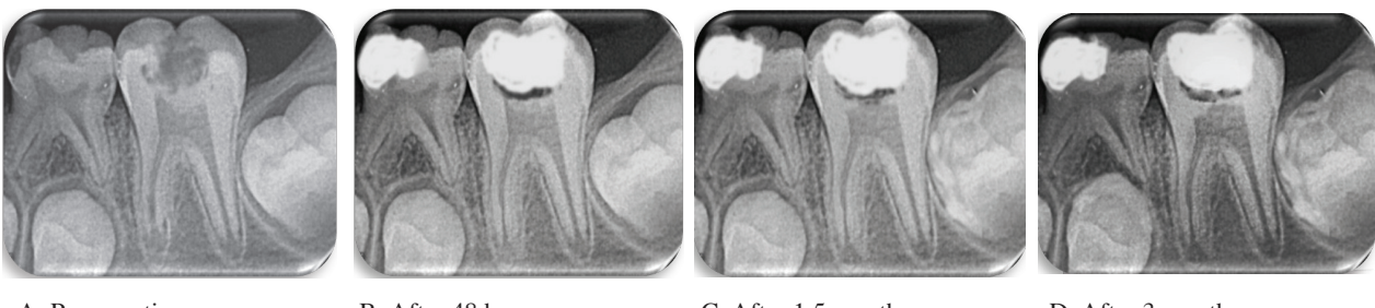
A: Preoperative B: After 48 hours C: After 1.5 month D: After 3 months Fig (1a): (A,B,C,D) Acemannan direct pulp capping for first young permanent molar of an 8 years old girl (group A).

to acemannan material and appear normal clinically and radiographically after 48 hours, 1.5 month and 3months. While the remaining 4 teeth (22.2%) failed to respond positively, after 1.5 month 2 teeth had pain with percussion and swelling clinically, and radiographically showed widening of periodontal membrane space and periapical radiolucency. After 3 monthes another 2 teeth had pain with percussion and widening of periodontal membrane space, one of them had swelling and presence of periapical radiolucency. For this reason, Apexification and/or endodontic treatment were performed for them.