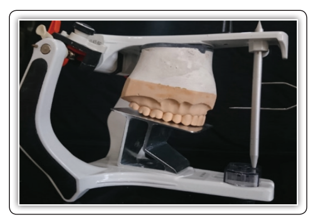
FIG (1) Cast articulated using Camper's table.

Maxillary and mandibular stone casts were fabricated by using a custom-made acrylic resin special trays with occlusal stops to produce a 1-2 mm space for a monophase medium-bodied consistency polyether impression material (3M ESPE Monophase). The impressions were poured with type IV extra hard stone (KIMBERLIT, Spain). The upper cast was mounted onto a semi-adjustable articulator using a Camper's table with a fixed 15-degree incline, Fig. (1). To allow assembling and reassembling of stone casts without mounting stone fracture, special mounting device (rail plate) was fabricated.