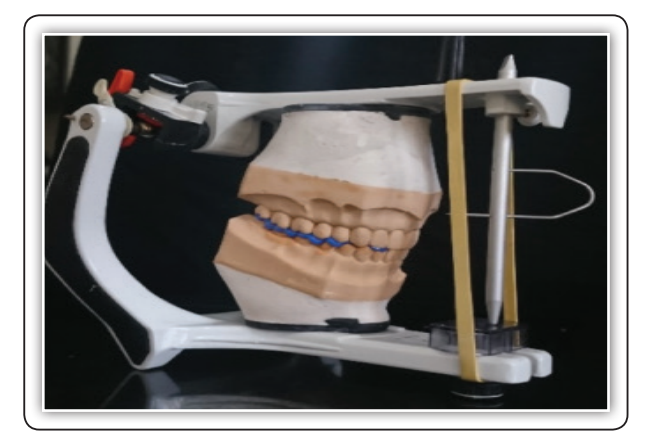
FIG (2) Registration with Bis-crylic resin (Luxa bite).

The polyvinyl siloxane bite material was supplied in a cartilage form so was directly expelled using a gun onto the occlusal surface. The Polyether bite material was supplied in a two-tube system which had to be hand mixed on a paper pad, uploaded into a syringe then injected. The Luxa bite material was supplied in a two-component tube with a mixing tip which was also just applied to the occlusal surface, Fig. (2). For each group the material was left to set for 4 minutes before removing. Any excess material was trimmed for easy repositioning and accuracy measurements. Bite registrations were utilized through twenty-four hours for articulation.