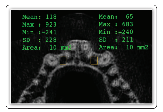
FIG (1) Bone Density measurements

the mean of the Grayscale value is calculated for the interdental bone at the preoperative and postoperative scans in a surface area<sup>(24)</sup></sup> of 10 mm<sup>2</sup>. Figure (1)