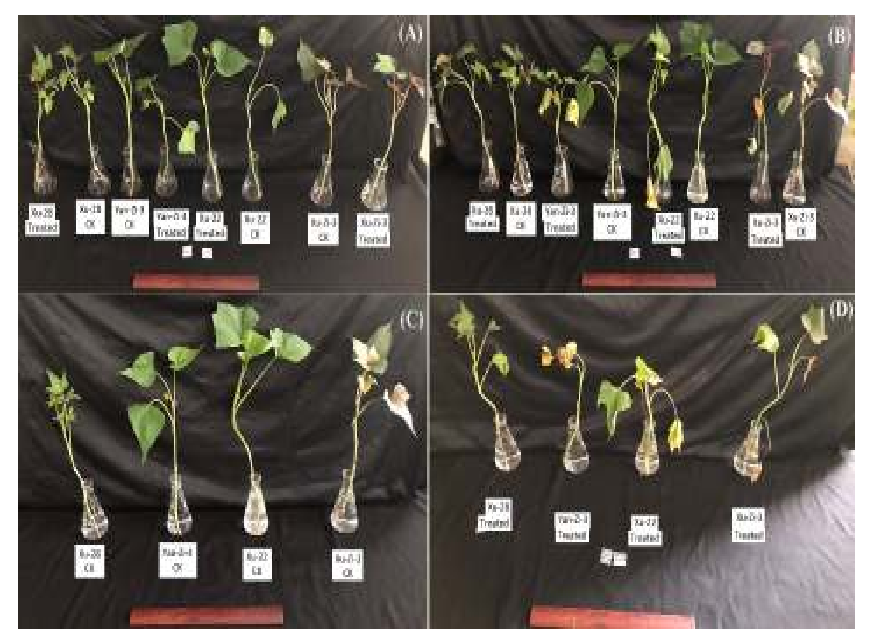
Fig. 1. Visual salt injury on four sweet potato cultivars (Xu-28, Yan-Zi-3, Xu-22 and Xu-Zi-3) under salt stress (200 mM of NaCl); A, salt treated plants after 12 hours of salt stress as compared to control, B, salt treated plants after 7 days of salt stress as compared to control, C, control plants of the four sweet potato cultivars, D, salt treated plants after 14 days of salt stress

SES Score: 1, tolerant; 9, highly susceptible; different small superscript letters indicate significant differences, determined by least significant difference (LSD) at P = 0.05.