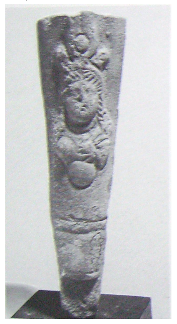
Pl.13 Terracotta torch decorated with bust of Isis on sun disc After, Bayer-Niemeier E., op.cit ,1988,Taf.124.1