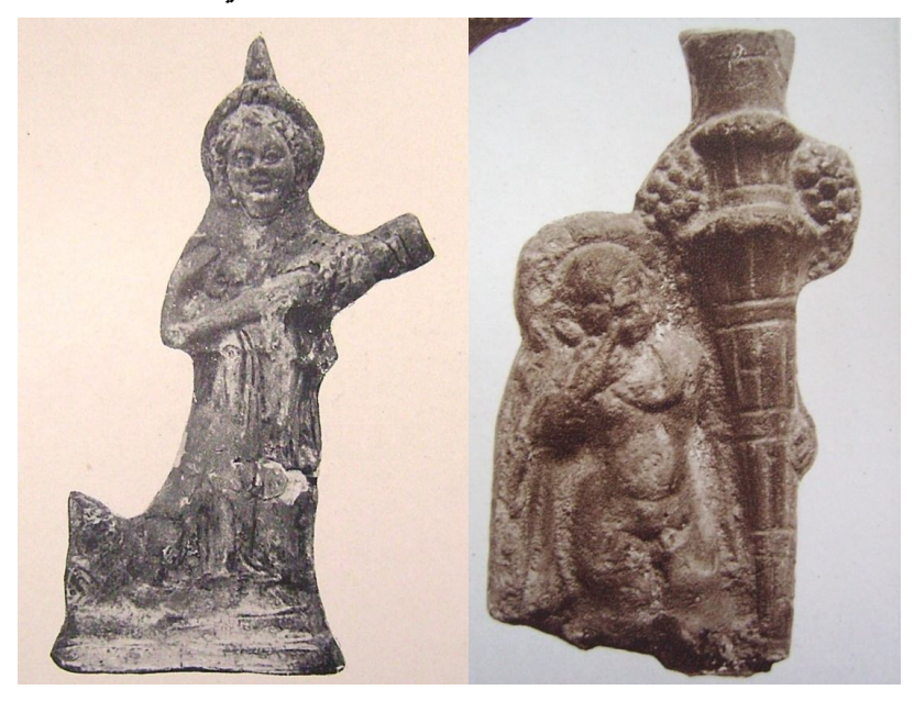
Pl.21 Harpocrates carrying a large torch