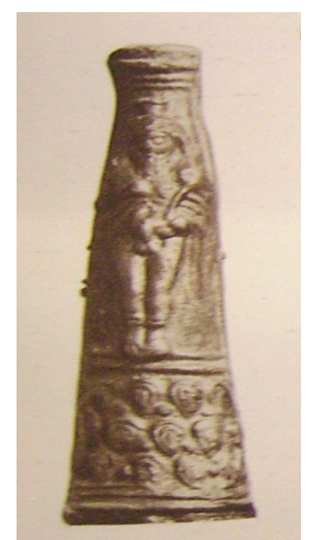
Pl.8 Terracotta torch decorated with figure of Priapus and engraved ears After,Breccia E., op.cit,1926,PL.CXIX,no.696