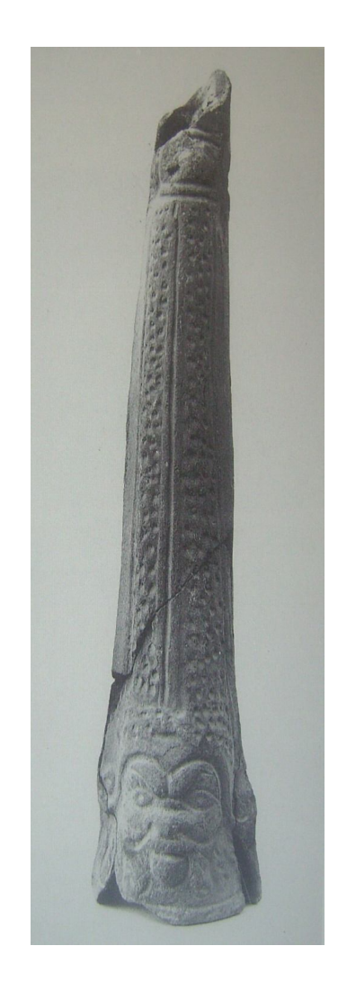
Pl.4 Terracotta torch with vertical lines,lozenges,and zigzag After, Dunand F., op.cit , 1990,, pl .971 1990,, pl.972

Pl.5 Terracotta torch with Bes head and tall plumes After, Dunand F., op.cit ,