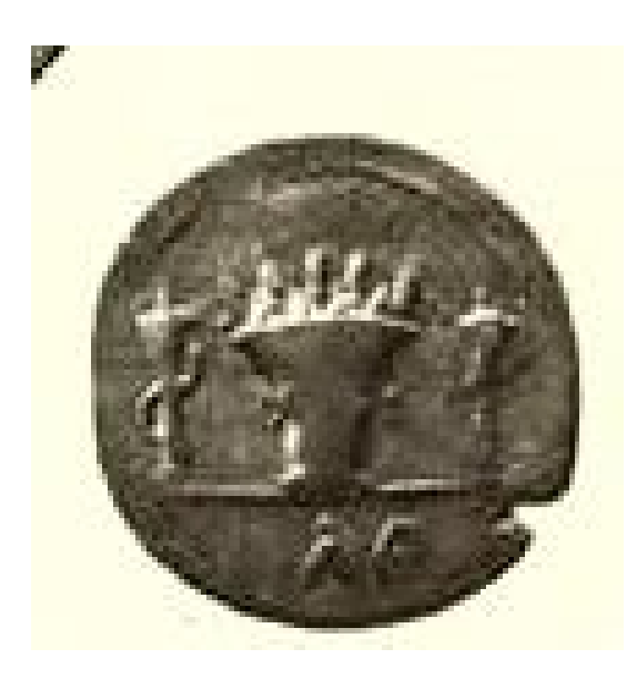
After, Kaufmann C.M., Ägyptische Terrakotten der Griechische-Römischen und Koptische Epoche, Kairo, 1913, Taf. 56

Pl.20 Modius headdress between two torches