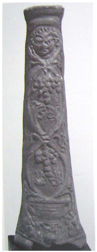
Pl.11 Terracotta torch decorated with Satyr head in the upper part and bunches of grapes with vine leaves After, Bayer-Niemeier E., op.cit ,1988,Taf.123.4