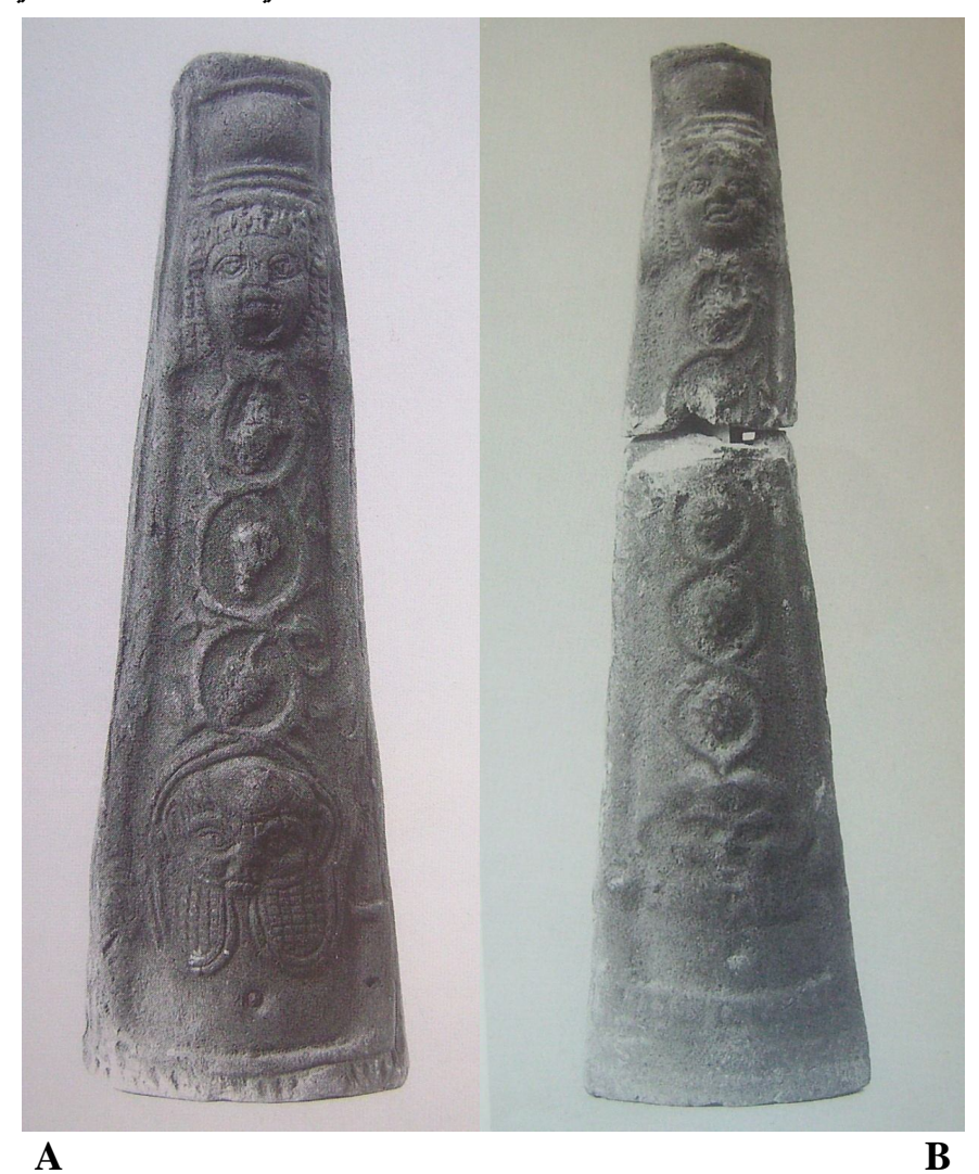
Pl.3 (A-B )Terracotta torches decorated with Bes and Beset with grapes After, Dunand F., op.cit , 1990,, pl. 970-973