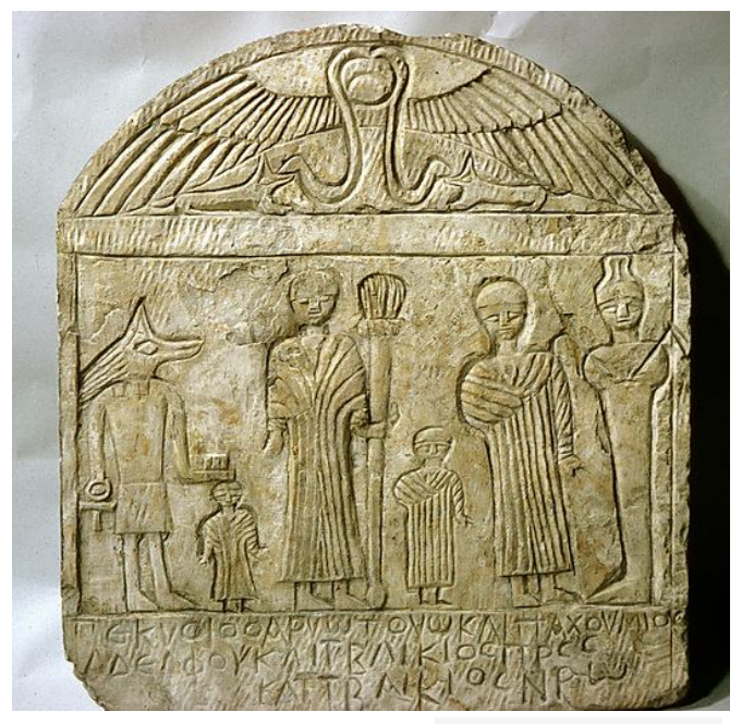
Pl.24 limestone funerary stela of Pekysis holding a torch After, Wypustek A., Images of Eternal Beauty ,2012,p.100