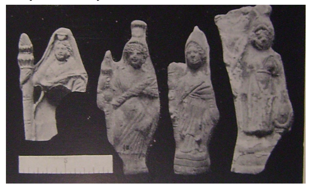
Pl.19 Hekate holding a torch