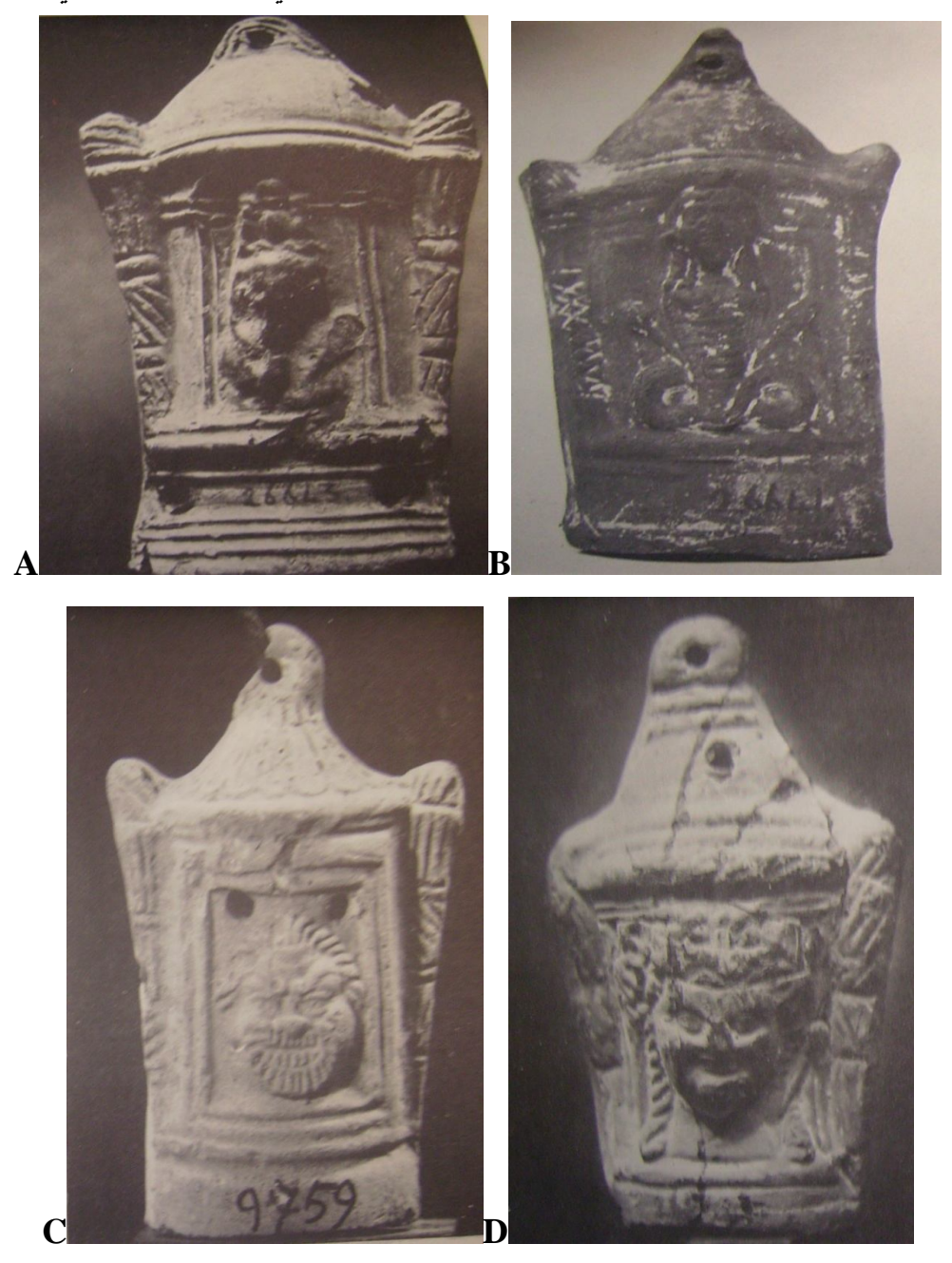
Pl.23 lanterns in the shape of Greek lamps , flanked by two torches framing the heads of Greek divinities

A-Harpocrates B-Isis-Thermouthis C-Silenus D-Dionysus or Satyr