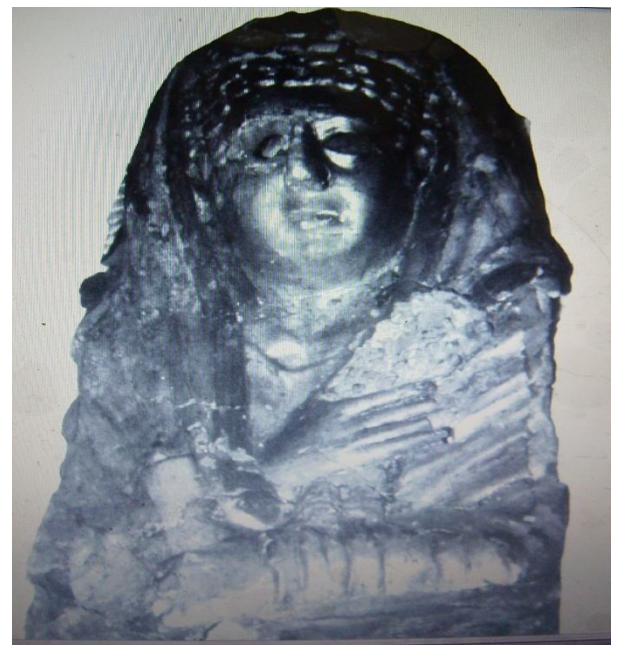
\ensuremath{\text{Pl.25}}\xspace A stucco mummy casting , the desceased woman is represented holding a lighted candle

After, Corcoran L.H., Portrait Mummies from Roman Egypt( I-IV centuries A.D.), Chicago, p.64, pl.25