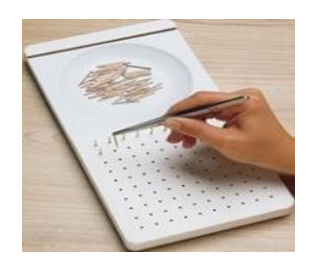
Figure 2. O'Connor Tweezer Dexterity.