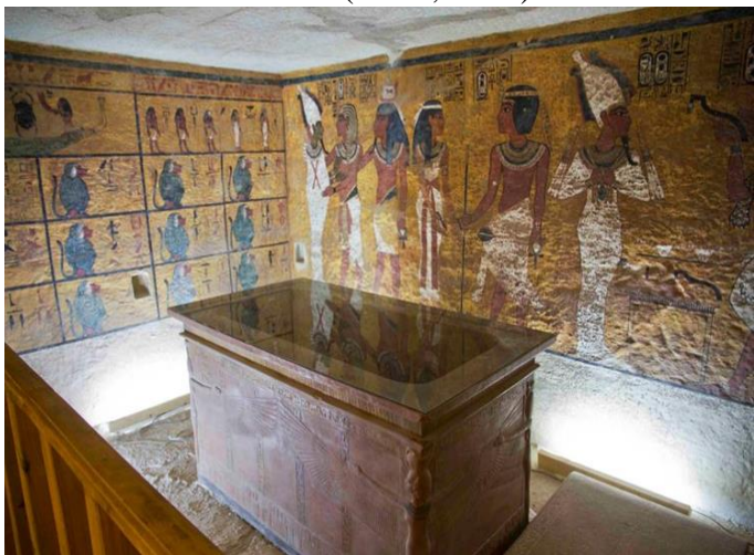
Figure 8. Facsimile of the Tomb from inside.