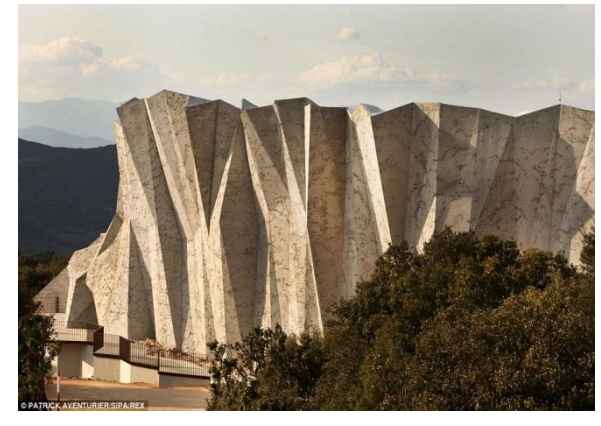
Figure 3. Replica of the cave is the biggest in the world. Source: (Amey, 2015)