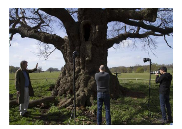
Figure 4. Old Oka tree at at Windsor Great Park, England.

technology to make it possible to scan this 900 year old oak tree (Factum arte Company, 2018c).