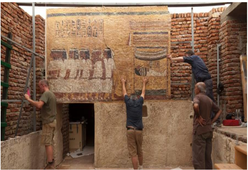
Figure 7. The assembly process of the tomb.