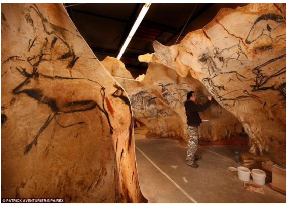
Figure 2. Drawing design of the replica according to the original model.