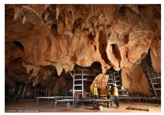
Figure 1. The construction of Chauvet-Pont-d'Arc Cave replica.