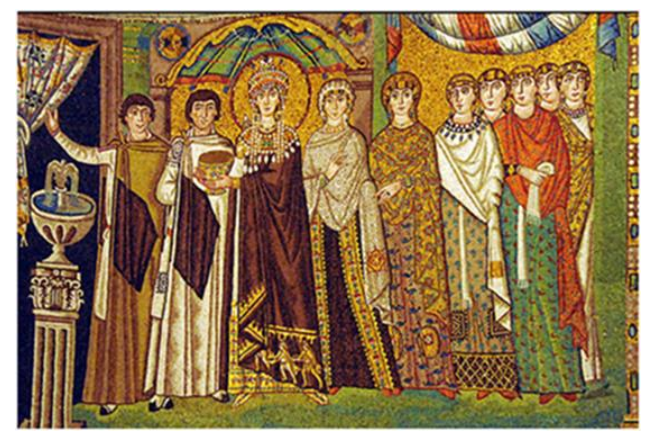
Fig 1: Apse mosaic of S. Vitale showing Theodora and her retinue Kleiner 2015: 267