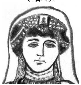
Fig 9: Detail of Theodosea's hairstyle on Antinopolis mural (fig. 4).