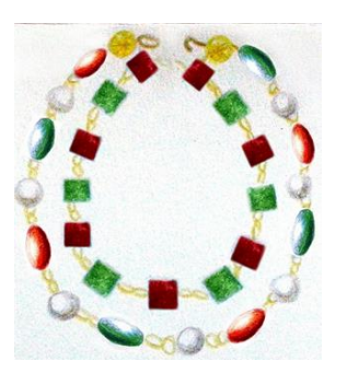
Fig 8: Restored perspective, detail of a necklace of a woman on a tapestry portrait-bust (fig. 3).