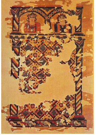
Fig 13: Large wall hanging showing a wealthy couple Calament 1996: 38