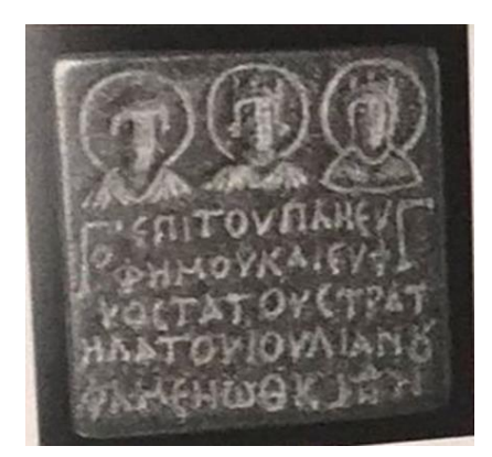
Fig 17: Weight with imperial busts and local official