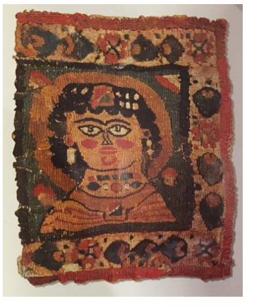
Fig 3: Tapestry portrait bust from Rose Choron's private collection Maguire 1999: 156, fig. C 15