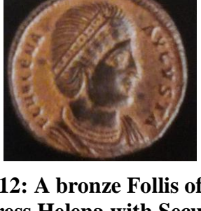
Fig 12: A bronze Follis of the Empress Helena with Securitas, Mint of Antioch, 325–26 Gittings 2003b: 58-59, fig. 16