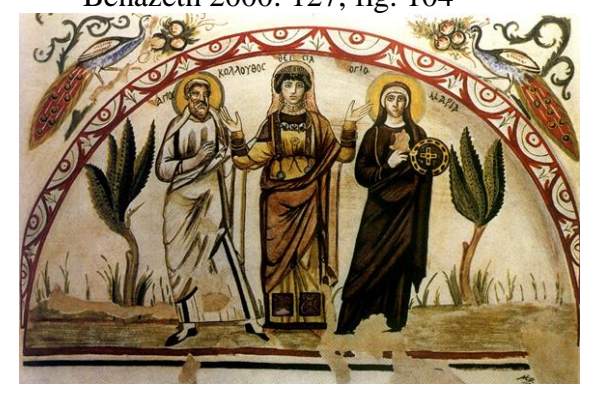
Fig 4: A mural painting from Antinopolis showing women's dress decoration Bénazeth 2000: 106-107