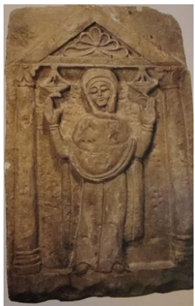
Fig 2: A limestone funerary stela from al-Fayoum, or Saqqara, showing typical women's clothing Bénazeth 2000: 127, fig. 104