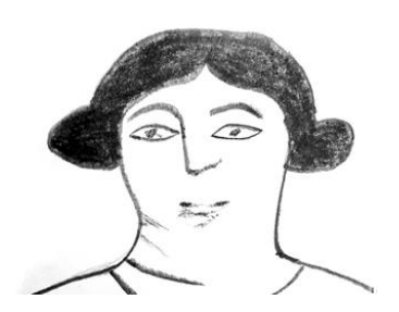
Fig 11: Detail of a head of a woman on the lid of a casket Mietke 2000: 15, fig. 144