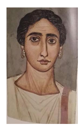
Fig 18: Portrait of a female teacher or philosopher Kalavrezou 2003a: 243, fig. 134

Fig 19: Empress bust weight Hermitage Museum and Pushkin