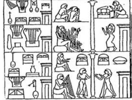
Fig. 2 Present some women combing anther women during Amarna life Erman, Life in Ancient Egypt, p. 153