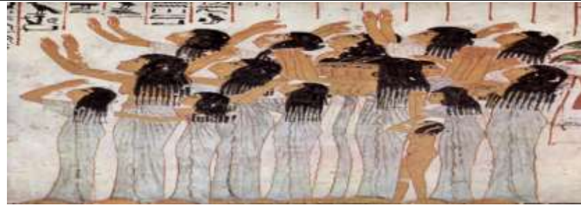
Fig. 4 View of mourners, Tomb of Ramose TT. 55 <a href="https://commons.wikimedia.org/wiki/File:Maler_der_Grabkammer_des_Ramose_001.jpg">https://commons.wikimedia.org/wiki/File:Maler_der_Grabkammer_des_Ramose_001.jpg</a>

https://osirisnet.net/tombes/nobles/amenemhat82/e_amenemhat82_04.htm