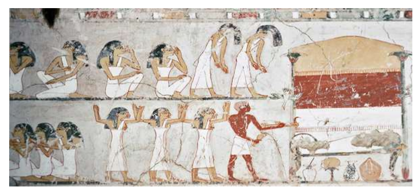
Fig. 3 View of mourners, Tomb of Amenemhat, TT. 53 from the time of Tuthmosis III

https://osirisnet.net/tombes/nobles/amenemhat82/e_amenemhat82_04.htm