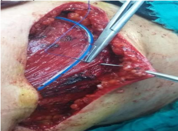
Figure [2]: Fixation of the lower mastectomy flap to the pectoral muscles

When ante-flexion was restricted by more than 20 degrees or exo-rotation was restricted by more than 10 degrees, home physiotherapy was recommended. Before surgery, on the first day of shoulder movements, and upon discharge, shoulder function, abduction, exo-rotation with the humerus in a neutral position, and exo-rotation with the humerus in abduction, were all measured. The contralateral shoulder was also measured at the beginning and end of the study. As a result, each patient had a "normal" baseline. A two-limb closed suction drain was employed.