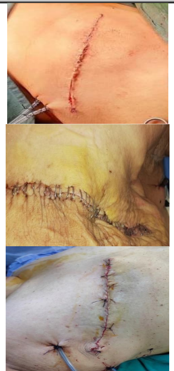
Figure [3]: Mastectomy wound closure after flap fixation

Adjuvant therapy: As regard to the final decision to the nature of adjuvant treatment was made following evaluation by a multidisciplinary team. The indication for radiotherapy following MRM was positive excision margins or positive axillary LN. High-risk patients were also, managed with Chemotherapy with respect to the National Institute of Clinical Excellence [NICE] guidelines. Endocrine therapy was offered to hormone receptor-positive patients. The study received ethical approval and signed informed consent from Al-Azhar University's Assiut ethical committee. Every patient completed a written informed consent form to accept the procedure.