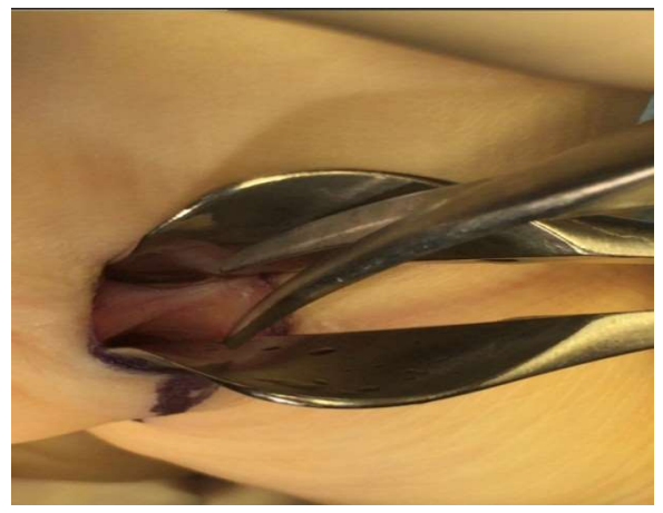
Figure [3] : Snip of the proximal edge of the transverse carpal ligament using scissor

Small snip using the blunt edge surgical scissor had been done for the flexor retinaculum [Figure 3], then the surgical Ballenger swivel knife [Figure 4] applied at the snipped retinaculum and pushed gradually to cut all the flexor retinaculum [Figure 5].