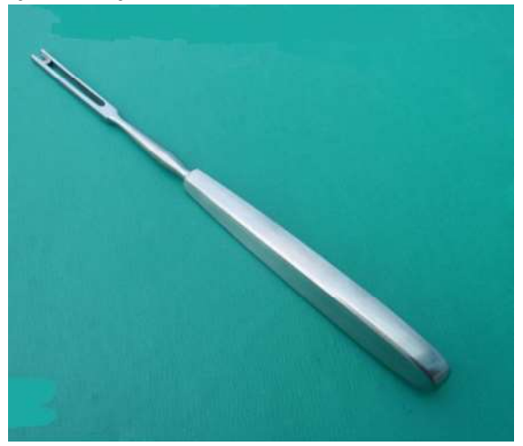
Figure [4]: Ballenger swivel knife