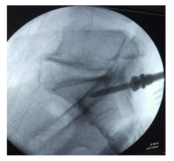
Figure [1]: Final position of the pedicular screw by fluoroscopy

The pedicular screws were inserted on both sides of the lumbar vertebrae with the application of rods and tightening of screws over the rods, and then laminectomy had been performed [figure 2]. Then the graft was finally applied at posterolateral gutters over decorticated facets joints and transverse processes.