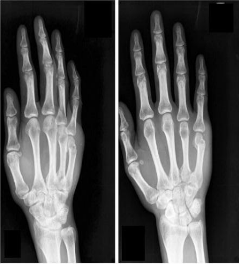
Figure [8]: Preoperative x-ray AP view [right] and oblique view [left]