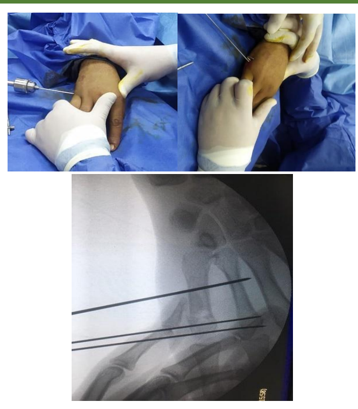
Figure [2]: Steps of transverse k-wire technique

Follow up: After either of the two techniques, a plaster splint had been applied postoperatively with the wrist in functional position including the wrist and fingers. It consisted of dorsiflexion of the wrist between 20 and 35 degree and flexion of the metacarpophalangeal [MCP] and proximal interphalangeal [PIP] joints between 45 and 60 degrees for 3 or 4 weeks. The hand had been kept elevated until edema resolved. An x ray had been carried out immediately postoperative, and serial x rays had been done every 3 weeks to assess degree of union. Active motion of the entire hand had been encouraged as soon as the postoperative splint had been removed after 3 to 4 weeks. After that, the use of the injured hand in activities of daily living had been encouraged within the limits of pain. Heavy work had been avoided until progress towards union became sufficient by radiological evaluation.