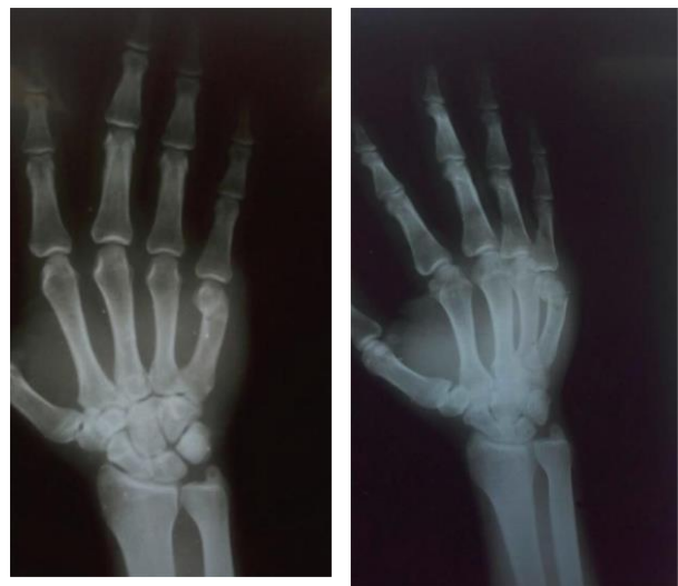
Figure [4]: Preoperative x-ray AP view [left] and oblique view [right]