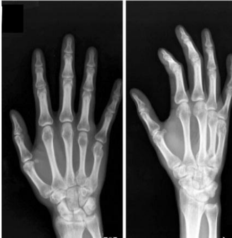
Figure [10]: Follow-up x-ray after 3 months AP view [left] and oblique view [right]