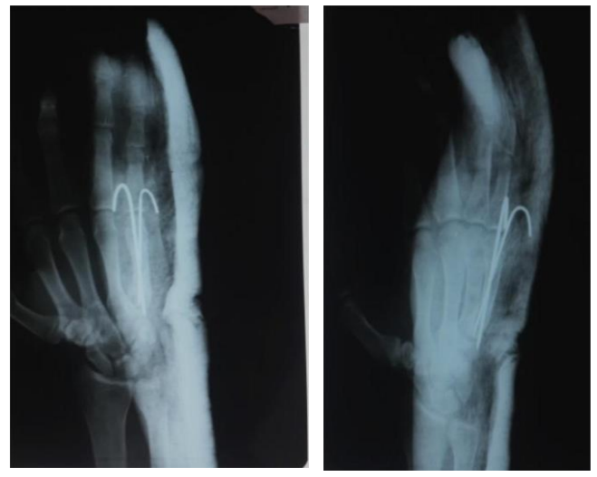
Figure [5]: Postoperative x-ray AP view [left] and oblique view [right]

Winter et al. <sup>[15]</sup> in their short-term retrospective study, with a mean follow-up of 2.7