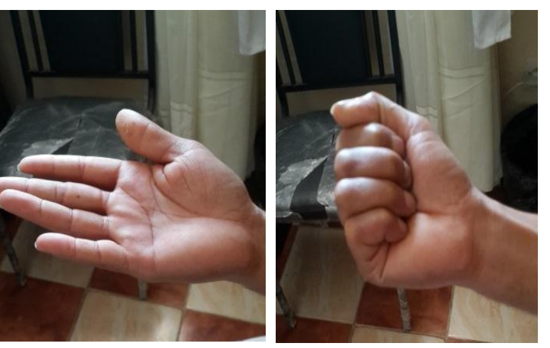
Figure[11]: Clinical follow-up after 3 months

For objective postoperative assessment, we used total active movement [TAM] score, which revealed comparable results between both techniques. Similar results were reported by Wong et al. <sup>[17]</sup>, who found that the mean TAM score was 250 for transverse group and 257 for intramedullary group in treatment of closed fractures of metacarpal of little finger. They included 59 patients and follow up was for 24 months.