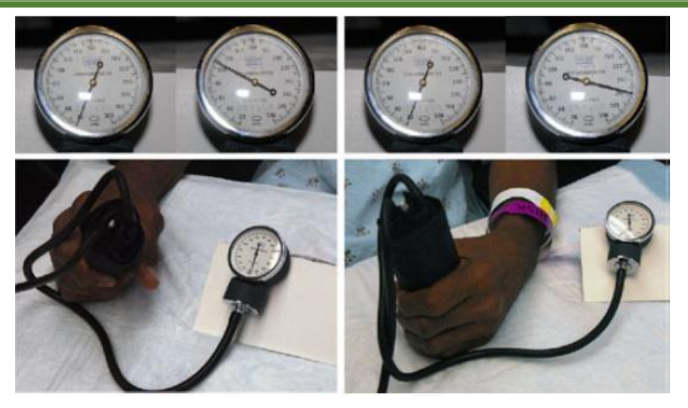
Figure [3]: Hand grip strength measuring

Data analysis: The collected data were fed to an excel sheet, coded and analyzed by statistical package for social science [SPSS], version 20 [IBM corporation, USA, Chicago]. Data were presented as mean±SD if they were numerical and as number [frequency] and percentage if they were categorical. Groups were compared by appropriate statistical tests [Independent samples student [t] test, Chi square, and Mann-Whitney [U] tests according to type of data]. The accepted error was set at 0.05, and considered as the cutoff for significance.