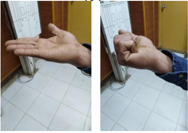
Figure [7]: Clinical follow-up after 3 months

months, reported that in the boxer's fracture, intramedullary pinning gave better functional outcomes than transverse pinning, although they concluded that intramedullary pinning is technically more demanding than transverse pinning and the surgeon has a more definite learning curve.