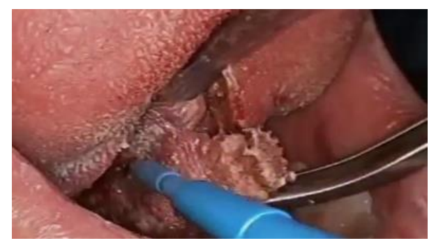
Figure (3): Excision of middle portion of the tongue base using Bovie coagulation electrocautery.