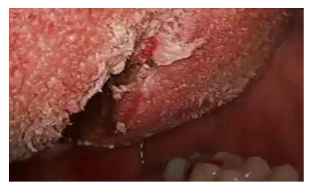
Figure (4): Gap after removal of middle portion of tongue base closed by absorbable suture

Post-operatively, all patients received oral antibiotics, analgesics, and anti-edematous drugs with oral soft diet for 7 days, with routine follow up to monitor surgical healing and manage any complications. After 6 months overnight polysomnography and Muller maneuver had been repeated.