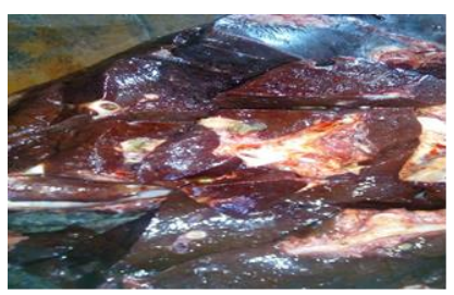
Figure 1 Cattle liver show Fasciola affection and cirrhosis of bile ducts

Annual financial assessment of condemned liver due to fasciolosis in the examined carcasses was recorded in Table (4). Total losses were summed to be 11712.5 LE along the investigation period, where 2017 recorded higher losses (7132.5 LE) than 2018 (4580 LE).