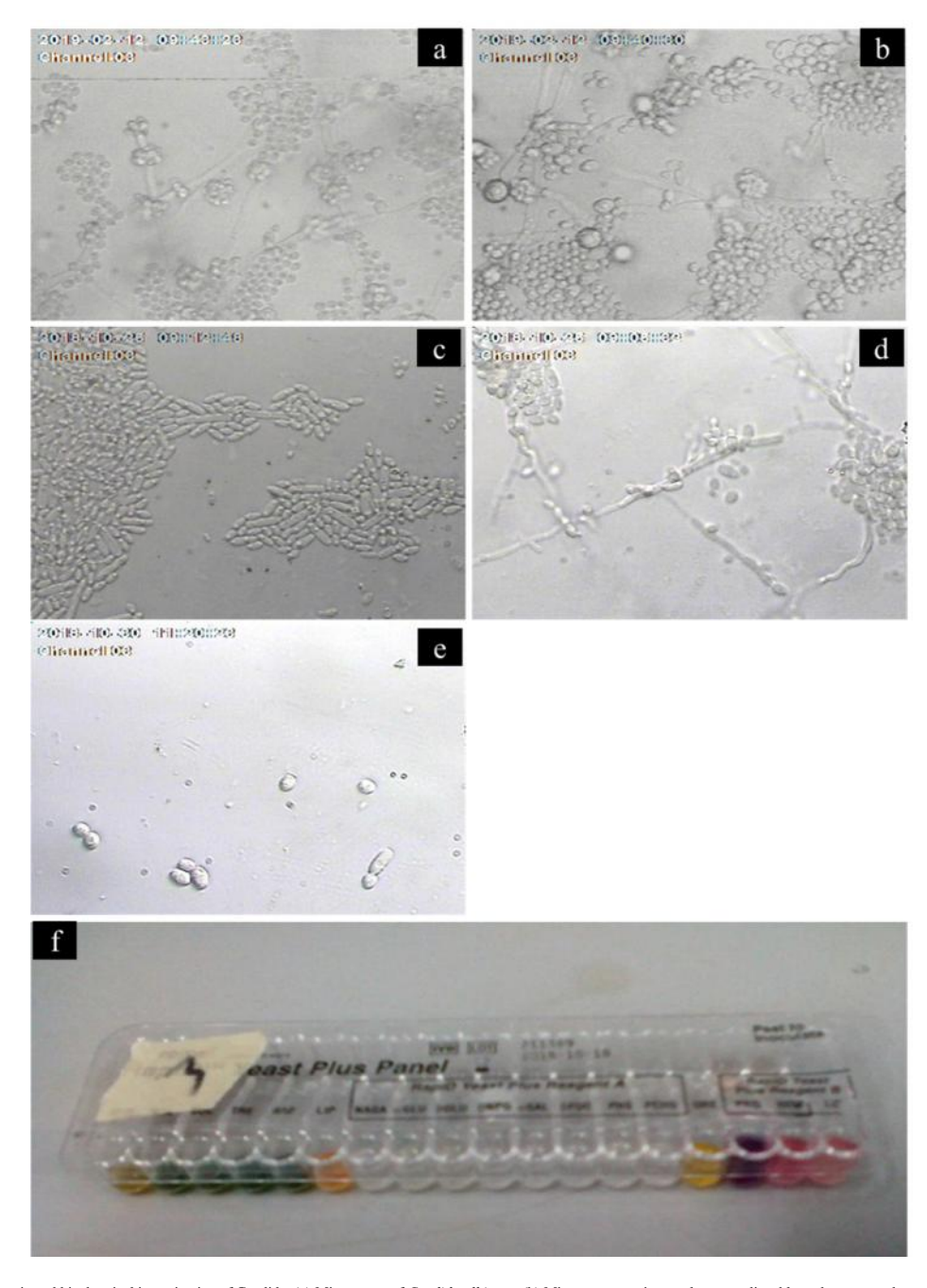
Figure 1 Microscopic and biochemical investigation of Candida. (a) Microscopy of Candida albicans . (b) Microscopy on rice meal agar media, chlamydospores and pseudo hyphae. (c) Microscopy of Candida parapsilosis . (d) Microscopy of Candida guilliermondii (e) Microscopy Germ tube test by using human serum after incubation 3hr. at 37 °C. (f) Rap ID Yeast system for Candida albicans .

Two Candida albicans isolates from chicken crop swab were examined by molecular methods polymerase chain reaction for confirmation of phenotypic identification.