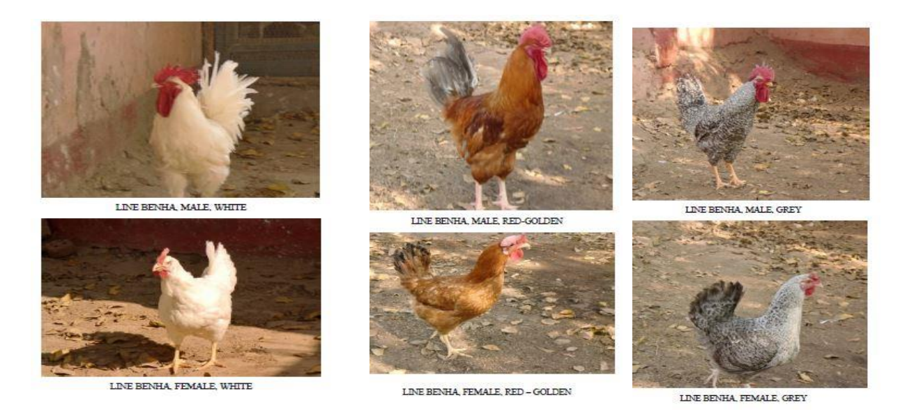
Figure 1: Examples of different genotypes of chickens.