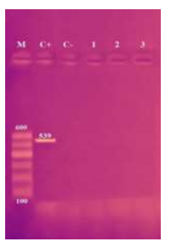
Fig.2. Agarose gel electrophoresis of PCR of 18S rRNA gene (539 bp) for identification of Sarcocystis species in camel tissues.

Lanes 1, 2 & 3 (suspected buffalo), 5 (apparently healthy buffalo), 8 (cow), 10, 11 (sheep) & 15 (goat): Positive bands for Sarcocystis species. Lanes 2, 6 (apparently healthy buffalo), 7, 9 (cow), 12 (sheep), 13 &14 (goat): Negative bands for Sarcocystis species.