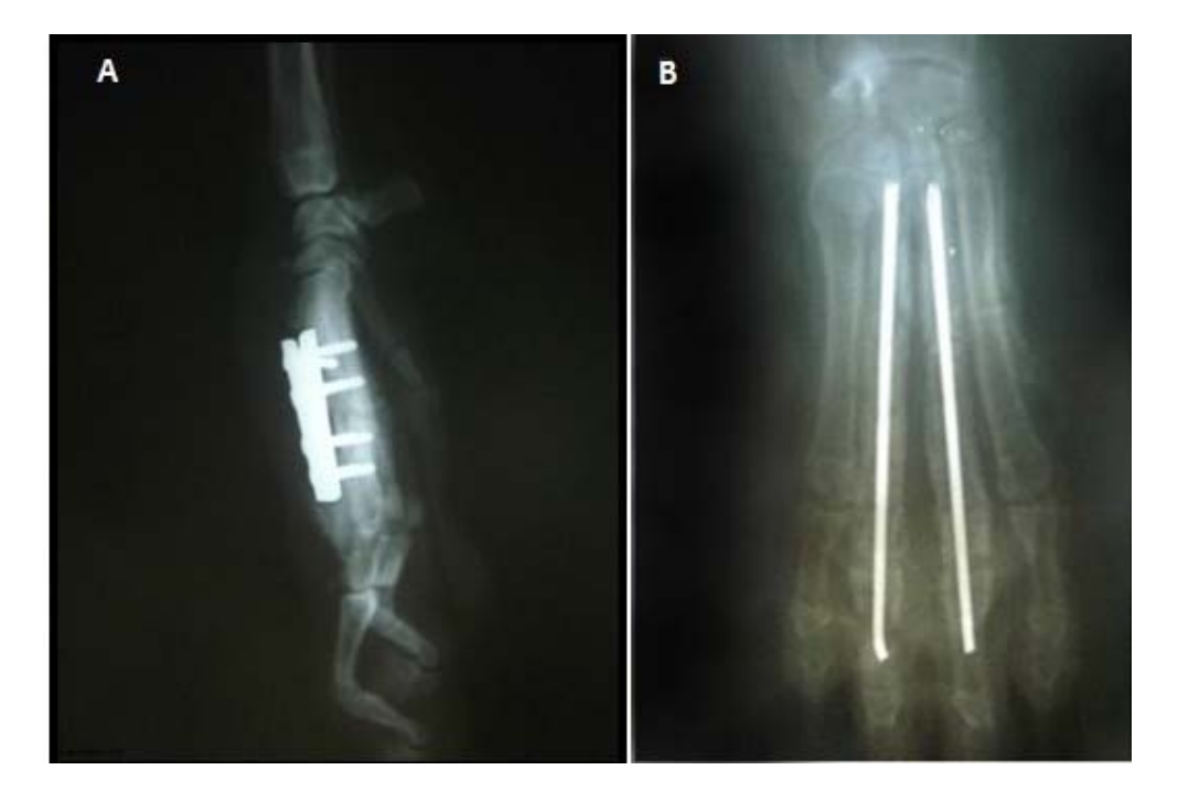
Fig(6): Mediolateral radiographic examination 45 days postoperatively after bone plating of metacarpal shaft fractures showing callus formation with nearly disappearance of fracture line (A). Dorso-palmer radiographic view 2.5 months postoperatively after intramedullary pinning of metacarpal shaft fractures showing callus formation and disappearance of fracture lines of fractured metacarpals (3<sup>rd</sup> and 4<sup>th</sup>) (B).