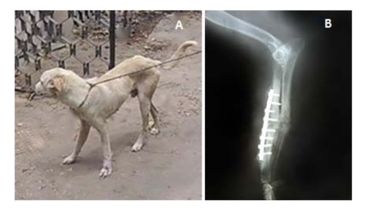
Fig(4): A complete weight bearing with full limb function after bone plating fixation of radial and ulnar shaft fracture of right limb 2 months postoperatively(A). Mediolateral radiographic inspection 3.5 months postoperatively after bone plating of radial and ulnar shaft fracture showing radial healing with little callus and ulnar healing with exuberant callus. Synostosis was also observed (B).