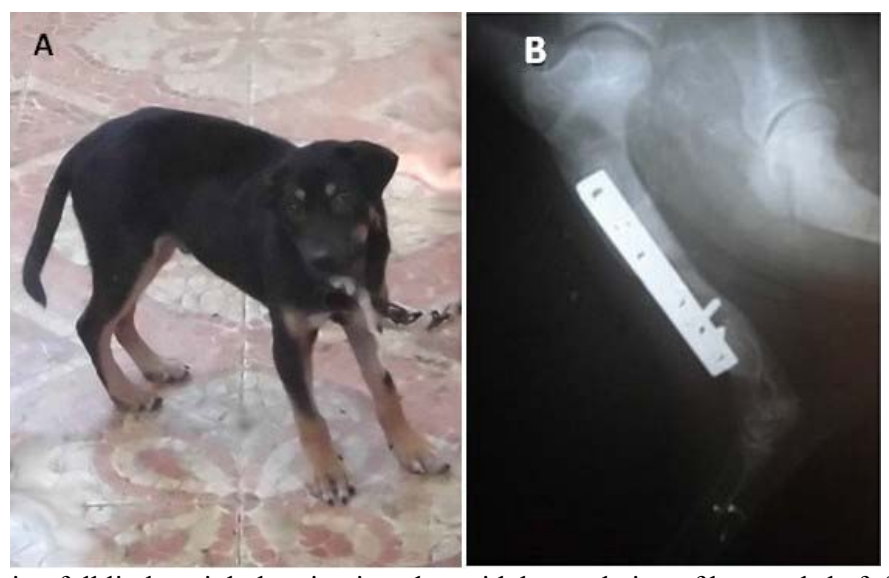
Fig (1): Showing full limb weight bearing in a dog with bone plating of humeral shaft fracture of right limb 2 months postoperatively (A). Mediolateral radiographic view 2 months postoperatively showing healing of transverse humeral fracture with intercortical callus with absence of bridging callus (B).

In most dogs. the post-operative radiographs showed good reduction and alignment of fracture fragments. In bone plating of humerus and metacarpals shaft fractures, the fracture healed with absence or little bridging callus around the fracture and the fracture line (Fig B). In bone plating of radial and ulnar shaft fractures: There was extensive callus around the ulnar fracture. Synostosis (Periosteal adhesion) was noted between the radius and ulna after repair of radial and ulnar fractures (Fig 4B). Extensive periosteal reaction was also noted around the plate. In IMP of humeral and metacarpals shaft fractures, Radiographic follow ups revealed secondary progressive callus formations mainly periosteal callus extending proximally and distally to the fracture Fig (2C and 6B). In unilateral acrylic TSF of radial fractures, callus formation around the fracture site with normal periosteal reaction around the pin insertion sites (Fig 3B). The increased bone density was also noted around the pin insertion sites. In external co-aptation of metacarpals fractures with plaster of paris bandages (Gypsona), fracture fragments of 3<sup>rd</sup> metacarpal bone were healed with malposition (Fig 5B).