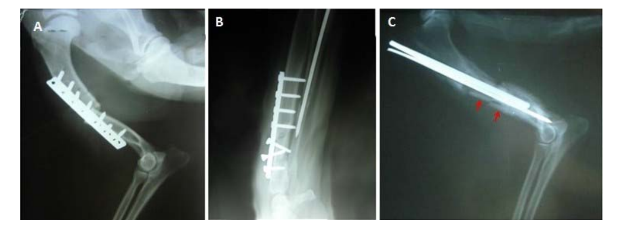
Fig(7): Mediolateral radiographic view of transverse humeral fracture plating 5 days post-operative showing failure of plate with bending and broken screws (A). Mediolateral radiographic image one week postoperatively after bone plating of radial shaft fracture showing implant failure and loosening of the three distal cortical screws (B). Mediolateral radiographic view one month post operatively after stack intramedullary pinning of transverse humeral fracture showing Osteomyelitis and lack of bone healing due to infection and a sequestrum including irregular periosteal reaction extended proximal and distal to the fracture site and areas of irregular bony reabsorption and destruction (arrows) (C).