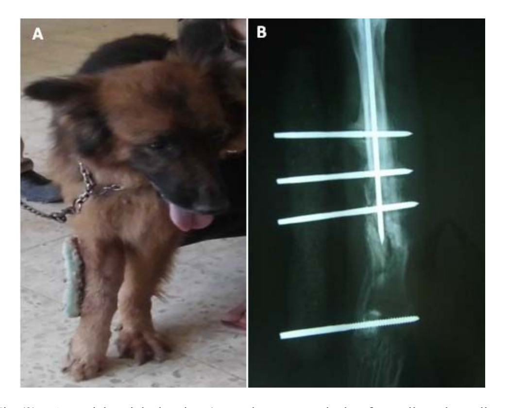
Fig (3): A partial weight bearing 1 month postoperatively after unilateral acrylic external fixation of radial shaft fracture of right limb (A). Craniocaudal radiographic view 2.5 months postoperatively after unilateral acrylic external fixation of radial shaft fracture showing increasing density of callus formation around the fixation pins (B).