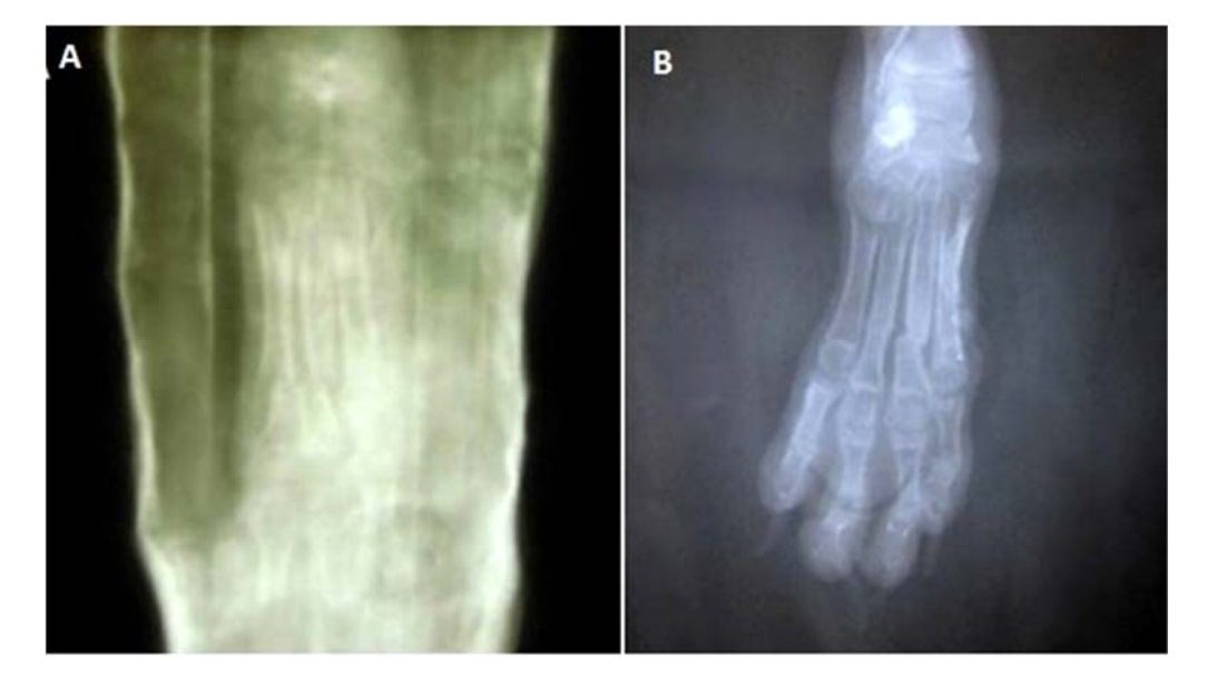
Fig(5): Dorso-palmer radiographic image 1month postoperatively after external co-aptation of metacarpal shaft fractures showing malpposition of fracture fragments of metacarpals (3<sup>rd</sup> and 4<sup>th</sup>) but the fracture healing begun at the contact parts of fracture fragments (A). Dorso-palmer radiographic view 2months postoperatively after removal of gypsona showing healing of metacarpal fractures but the 3<sup>rd</sup> metacarpal fracture fragments were malpposed (B).