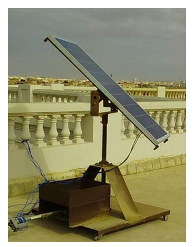
Figure 1 Tracking system for a 150 Watt PV module

part of a master thesis research, where results was validated and published in [14].