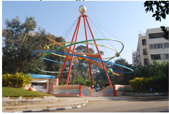
Children's Center for Creativity and Civilization, 2021:4.

The entrance path to the Egyptian Child Museum.