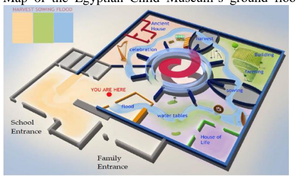
Fig. 6 Map of the Egyptian Child Museum's ground floor.

Children's Center for Creativity and Civilization, 2021:28.