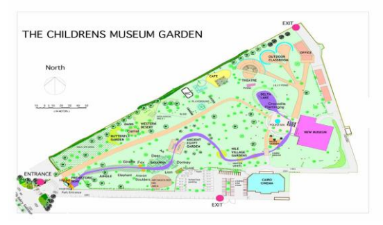
Children's Center for Creativity and Civilization, 2021:5.

The garden has a representation of the Nile river, starting with Ethiopia and ending with the Red Sea and the Delta. The Nile is surrounded by the scenery of the African rainforests, which features 3D representations of wildlife that used to live in and around the Nile, such as crocodiles, flamingos, antelopes, elephants, giraffes, hippopotami deer, donkeys, foxes, and lions. On the two banks of the Nile, children can enjoy a live exhibition zone of butterflies, birds and fish. They can also examine replicas of Bedouin and countryside houses and enjoy playing in the outdoor excavation area. Moreover, the garden embraces a theatre for concerts and puppet shows, a cinema with 3D projection facilities, a library stocked with educational literature, outdoor classrooms for creative and musical activities, a playground, a gift shop and a cafeteria (Children's Center for Creativity and Civilization, 2021). Artwork, painting, and ceramics are among the various activities and crafts that may be practiced in the garden. In addition, technical activities courses and summer camps are also available. Aside from that, separate sections are allocated for birthdays and gatherings.