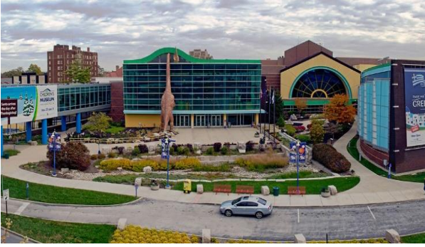
Fig. 1 The Indianapolis Children's Museum

In 2021, the Children's Museum of Indianapolis has been chosen as the best museum for families in the US that offers significant interactive experiences for children and adults alike (Cimini et al., 2021). The Indianapolis Children's Museum is the world's best, largest, and fourth-oldest museum of its kind (fig. 1). It was founded in 1925 by Mary Stewart Carey after being inspired by a visit to the Brooklyn Children's Museum in 1924. It is located in 3000 North Meridian Street, Indianapolis, IN, USA, encompassing almost 500,000 square feet of fun-filled experiences, and receiving more than one million visitors annually (The Indianapolis Children's Museum, 2019a). The museum has been accredited by the American Alliance of Museums (AAM) and its stated mission is to "create extraordinary learning experiences across the arts, sciences, and humanities that have the power to transform the lives of children and families" (The Indianapolis Children's Museum, 2021)