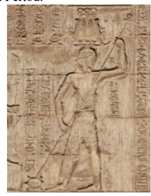
Taylor, I.R. Deconstructing the iconography of Seth, Fig. 9.95.

Empror Titus harpoons the turtle, temple of Khnum, Esna. Roman Period.