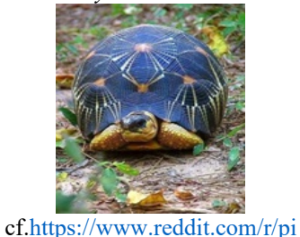
cs/comments/ 87jd9p/radiated_tortoise_of_ madagascar/

The radiated tortoise Astrochelys Radiata