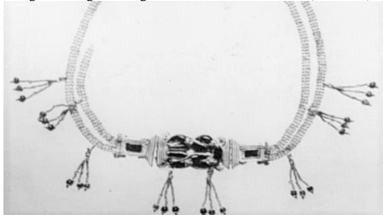
Figure 2: A gold and garnet Herakles knot diadem (JE 67881)